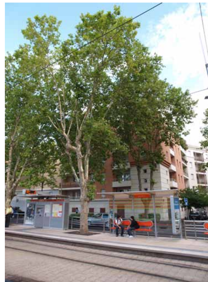
INTELLIGENT STOP DESIGN SAFEGUARDS EXISTING TREESCAPE MONTPELLIER

The majority of stops outside of Downtown will follow a standard design. Because of the longer stop spacing and higher boardings per stop compared with HSR buses, the shelters are likely to have a higher capacity than a standard bus stop, and may also be provided with more comprehensive climate protection. They should fit in well with the scale of adjacent commercial and residential properties or development without dominating the environment. Identity and variation between stops can be achieved by means of different materials, colours, landscaping, information totems and art features.