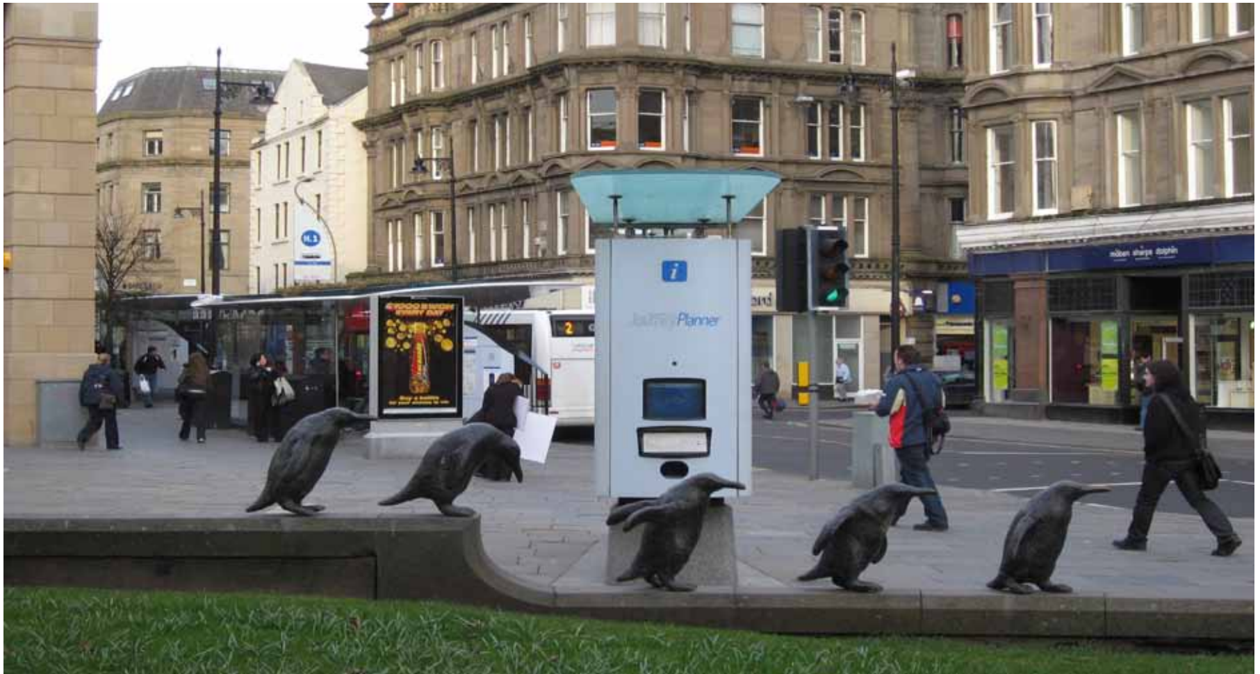
PUBLIC ART CAN ADD ENTERTAINMENT TO THE STREETScape DUNDEE