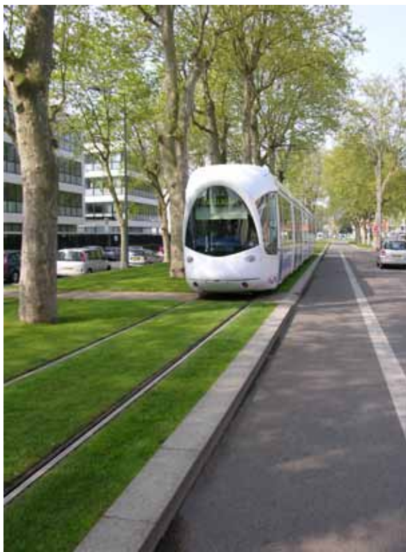
GRASS TRACK CAN ENHANCE THE STREETScape LYON