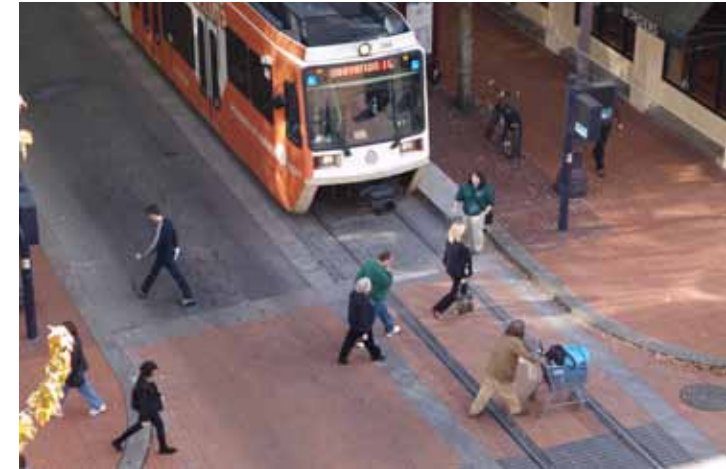
WELL DESIGNED PEDESTRIAN CROSSWALK WITH MINIMAL STREET CLUTTER PORTLAND

Other improvements, such as improved lighting on pedestrian routes, should also be included. Lighting quality can play a central role in creating safe and pleasant environments. Lighting appropriate to its location and function will result in increased safety, legibility, accessibility, security, and ambience.