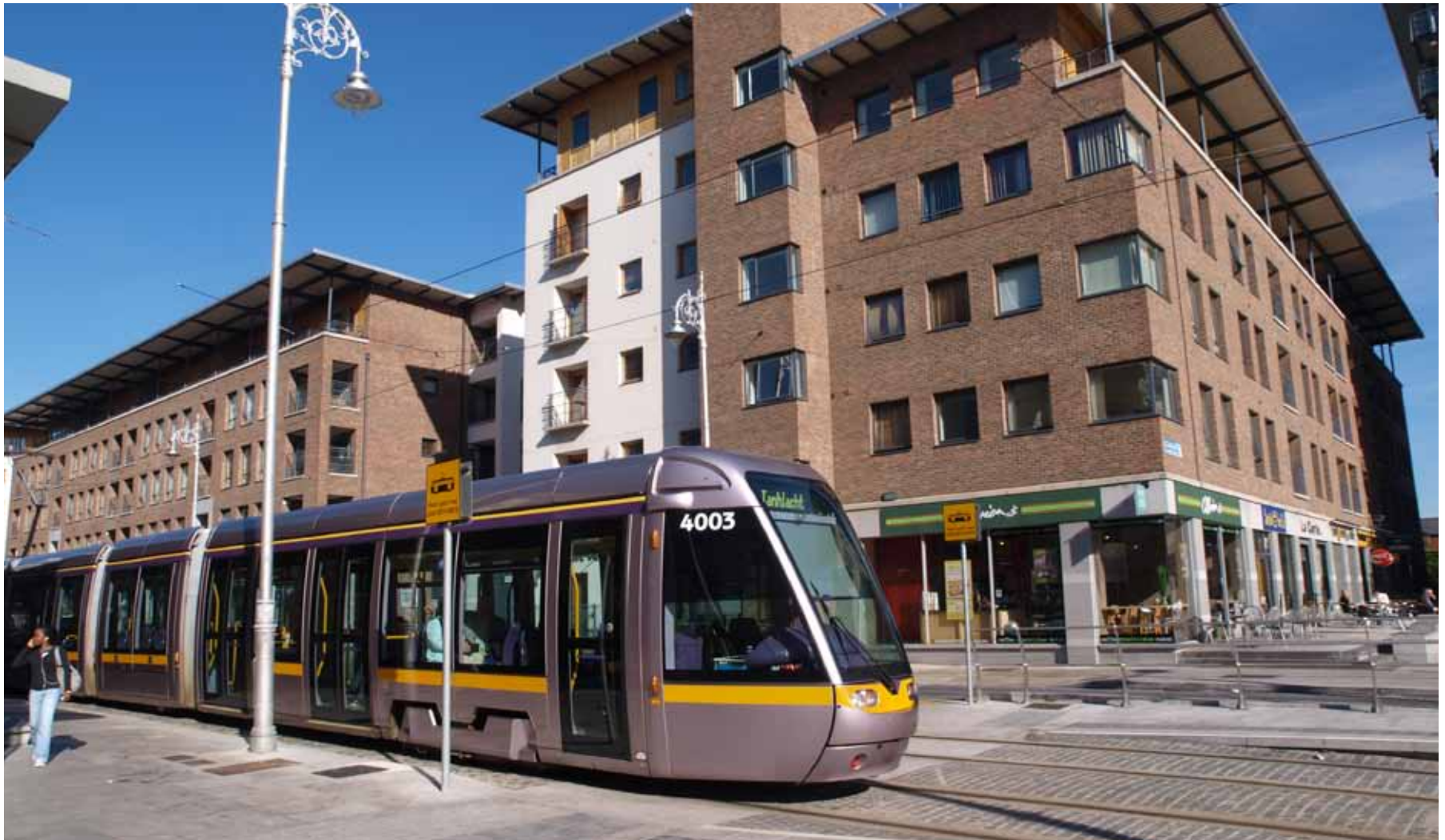
LRT SUPPORTING TOD DEVELOPMENT DUBLIN