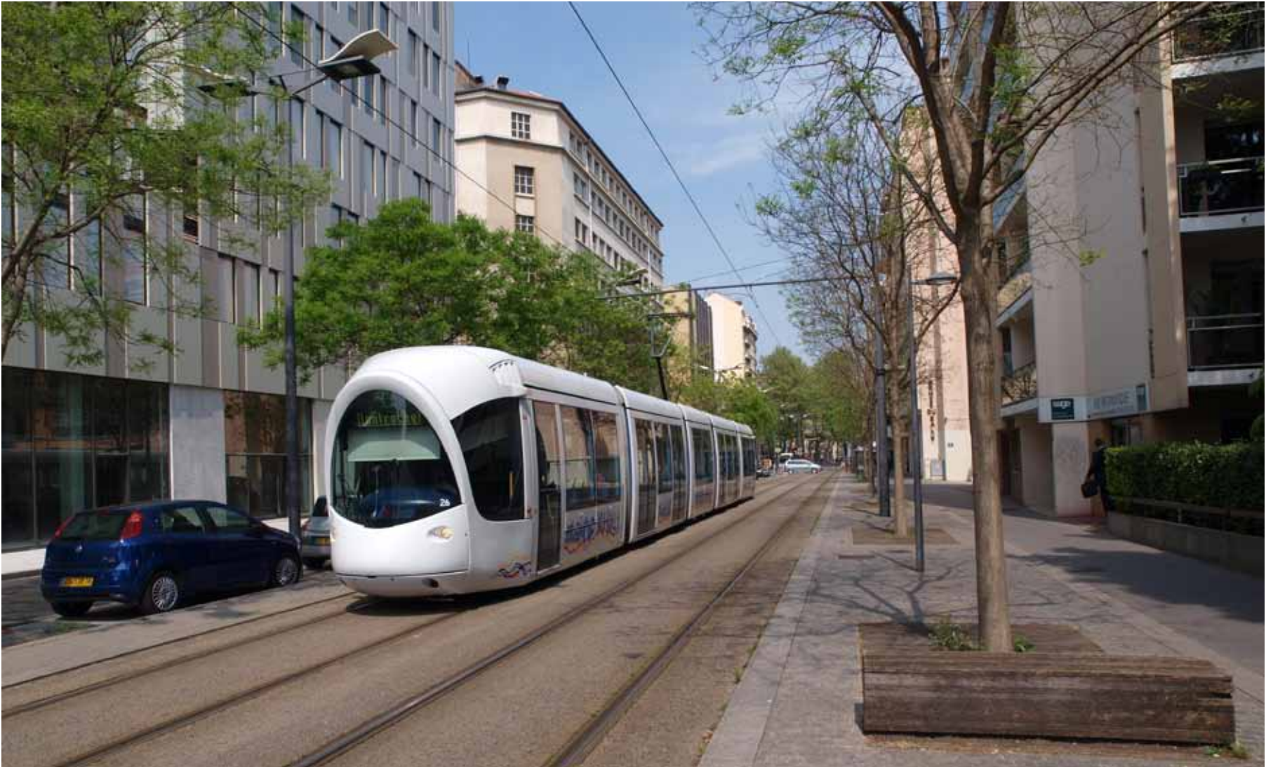
CLEAR DELINEATION OF STREET COMPONENTS