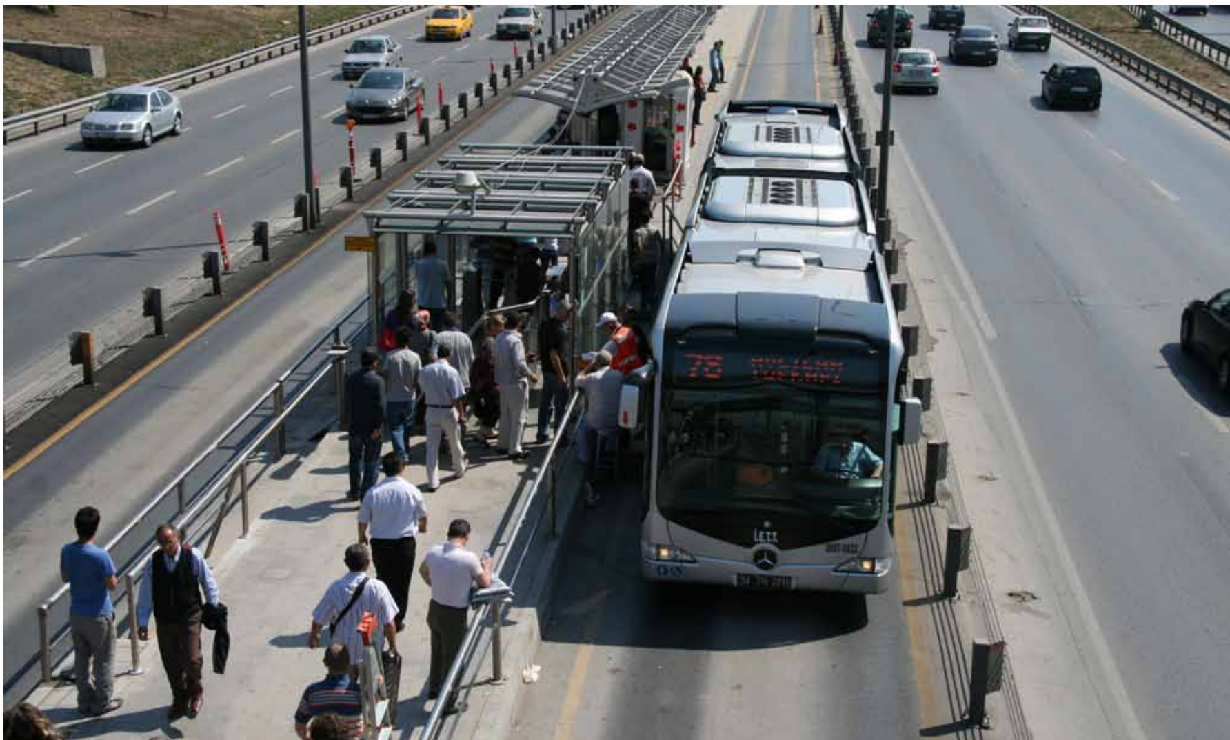
SEGREGATED BRT RIGHT OF WAY ISTANBUL