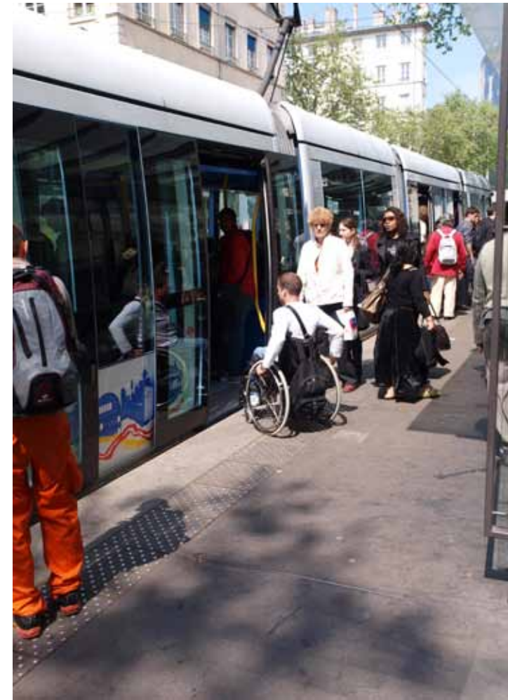
MODERN LOW FLOOR LRT: ACCESS FOR ALL LYON

Accessible – LRT systems should be fully accessible to all members of the community, including wheelchair and mobility scooter users and others with mobility impairments, as well as passengers with strollers or luggage. The specification of the proposed system will meet these requirements with the provision of level boarding from low platforms.