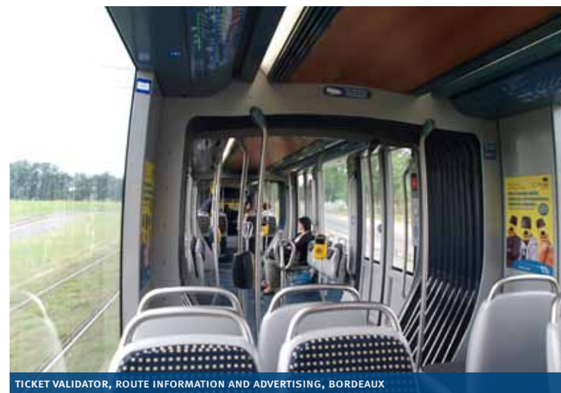
TICKET VALIDATOR, ROUTE INFORMATION AND ADVERTISING, BORDEAUX