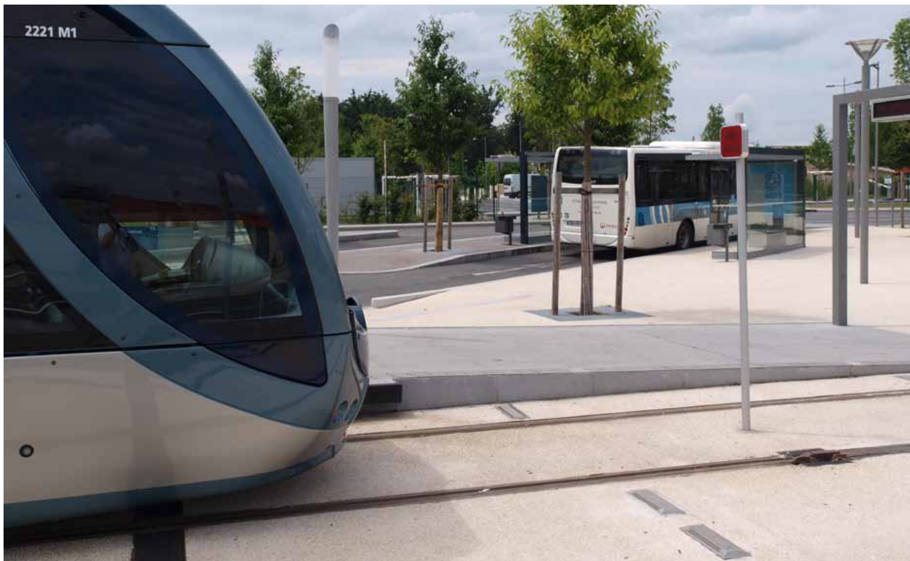
SIMPLE AND EASY CONNECTIONS BETWEEN LRT AND BUS BORDEAUX