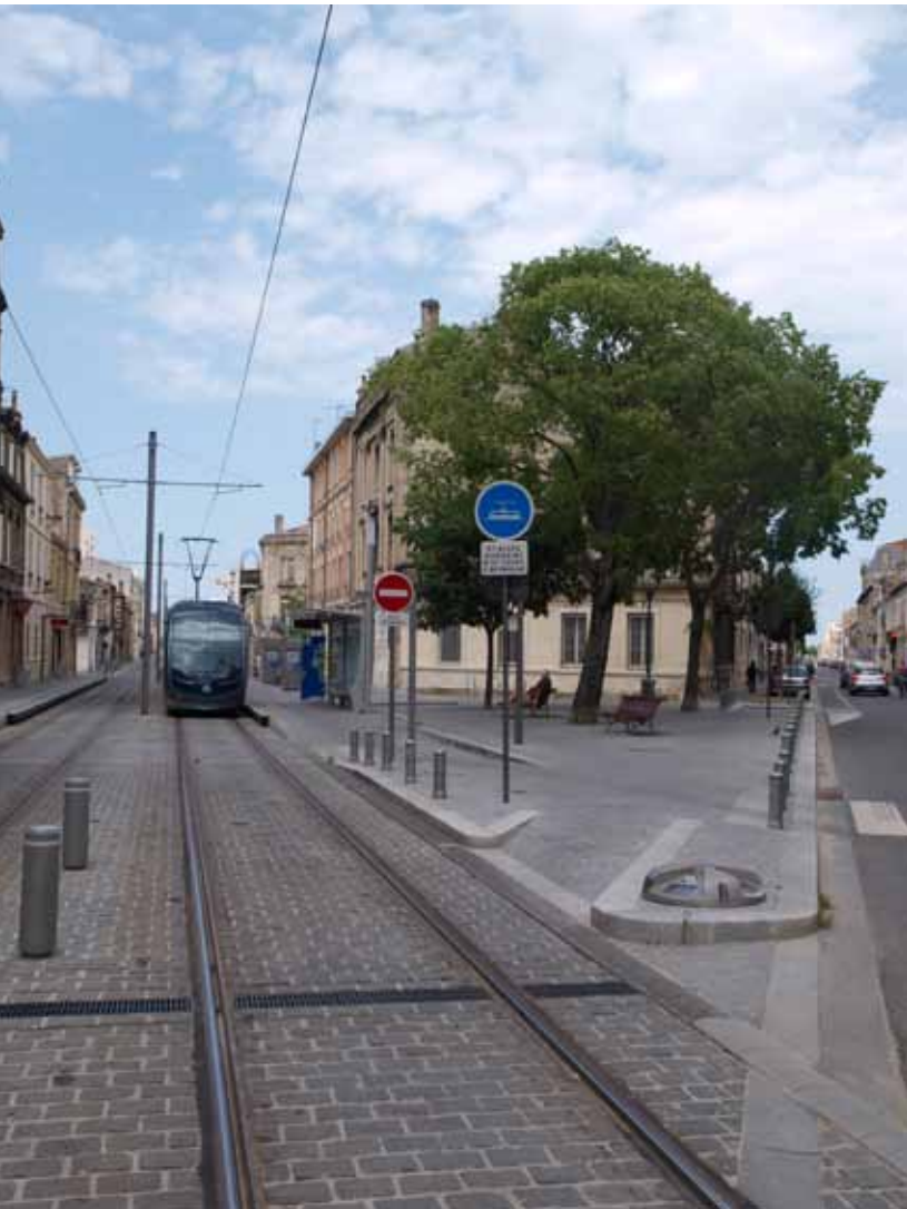
HIGH QUALITY URBAN DESIGN- TRACK, LANDSCAPING, AND LEVEL SURFACES BORDEAUX

Subtle natural tones should be used for all surfacing, rather than bright colours, which can impair the visual quality of the street. Surfacing and paving materials should be sustainable and cost-effective in the long term, considering durability, capital and life-cycle (maintenance) costing, as well as sourcing, quality and appearance.