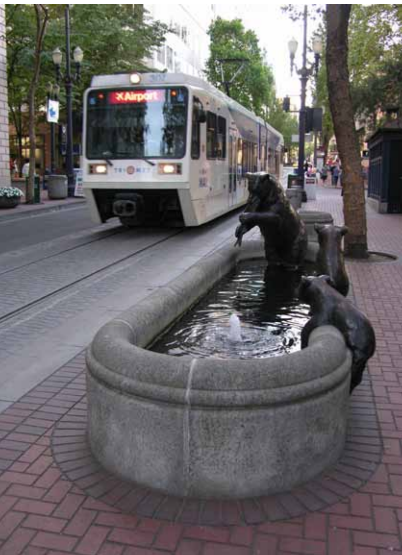
LOCAL PUBLIC ART CAN ENHANCE THE STREETScape PORTLAND