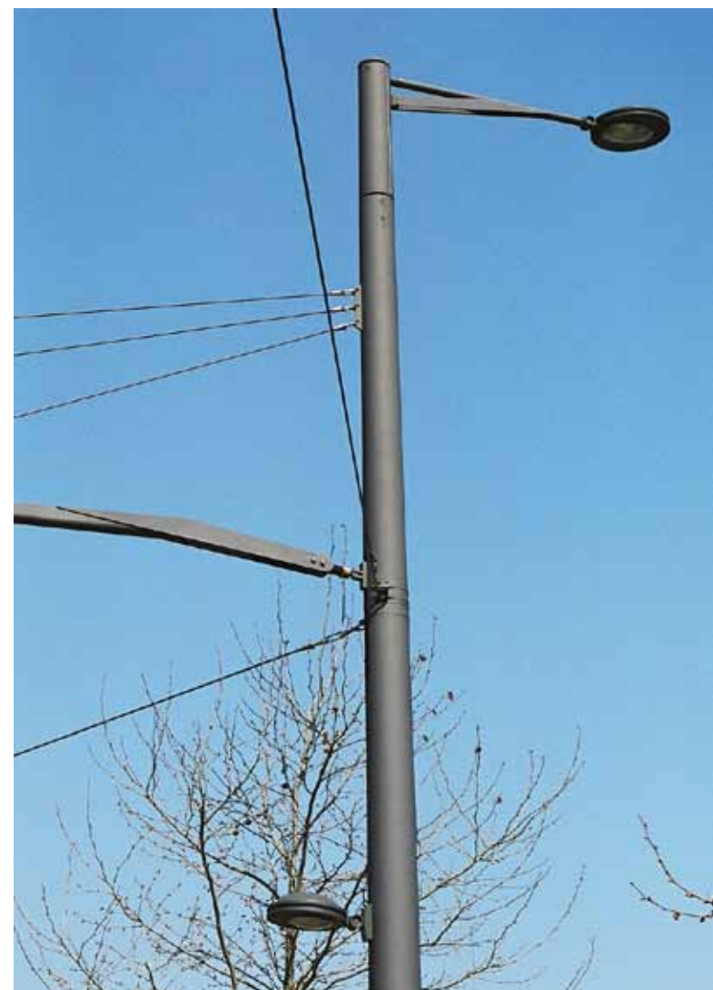
COMBINED LIGHTING AND OVERHEAD WIRES REDUCES CLUTTER

The design of the overhead line supports should aim to minimise the vulnerability of each support to damage. The loss of any one support (e.g. as a result of a pole being struck and damaged by a road vehicle or a fire loosening a building fixing) may release tension in the overhead line system but the design should allow other supports to prevent live equipment from sagging below a minimum wire height. This approach is aided by having an increased standard wire height, compared with current Canadian practice.