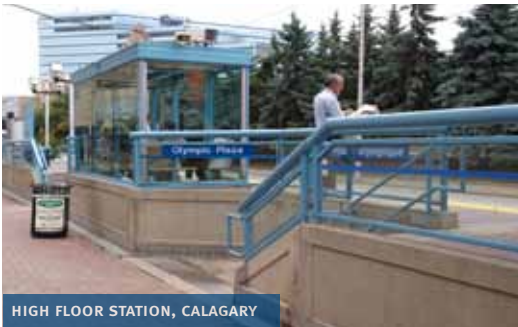
HIGH FLOOR STATION, CALAGARY