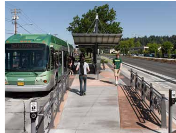
HIGH QUALITY BRT STOP EUGENE