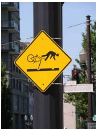
LRT AND CYCLE SAFETY IS A KEY ISSUE