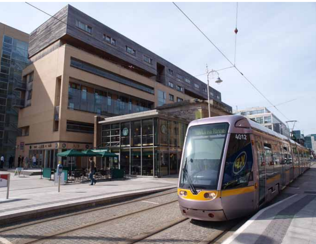
A COORDINATED APPROACH LINKS LRT AND TOD DEVELOPMENT DUBLIN