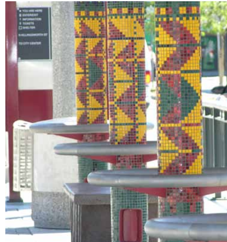
COMMUNITY-BASED PUBLIC ART USED TO CUSTOMIZE A NEIGHBOURHOOD LRT STOP PORTLAND