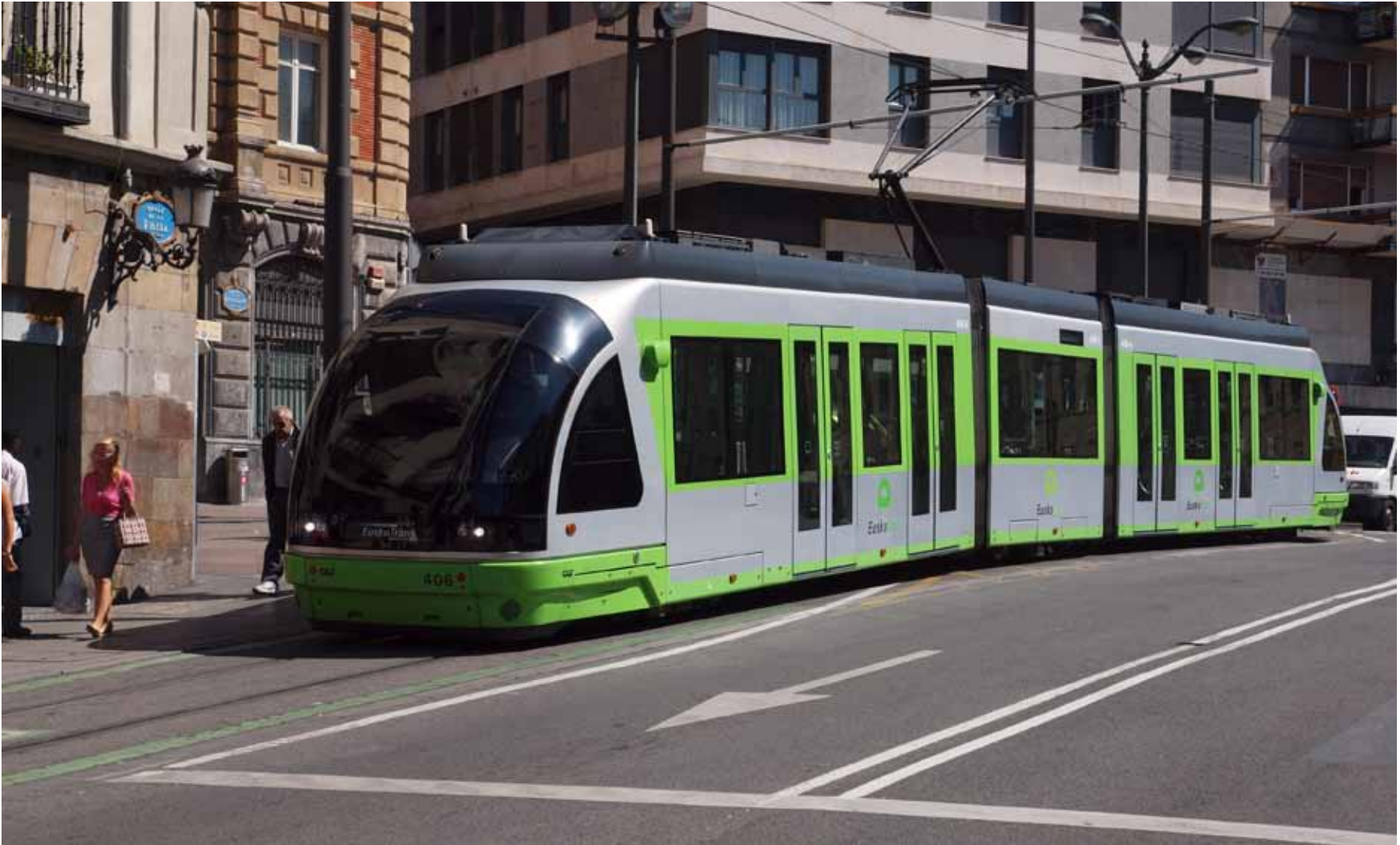
SHARED RUNNING BILBAO