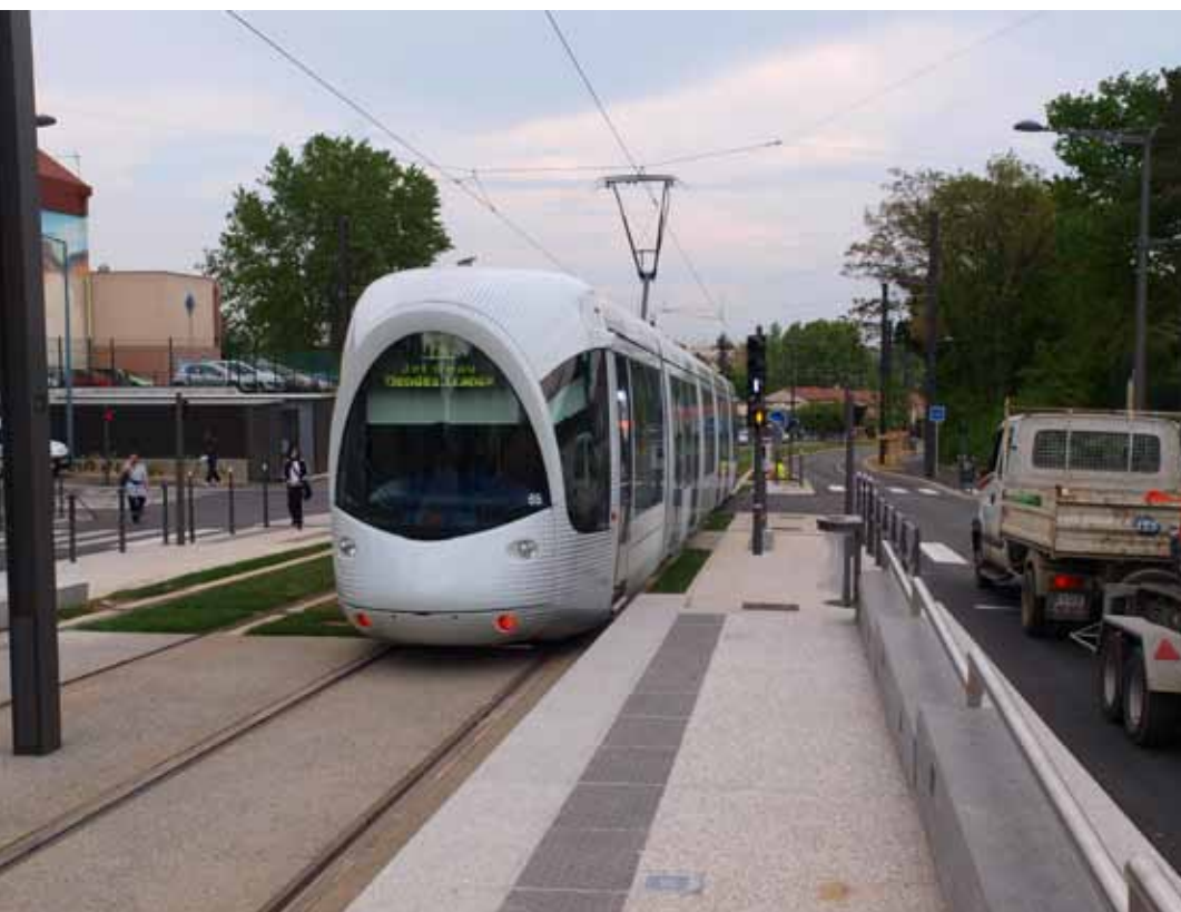
CENTRE POLES LYON