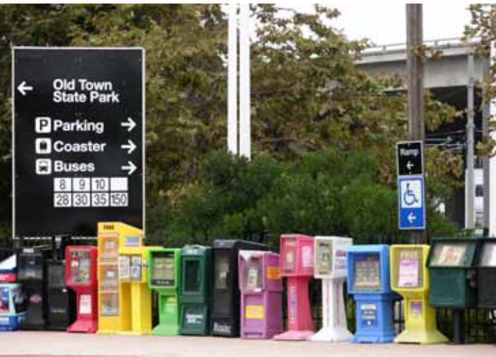
STREET CLUTTER SHOULD BE MINIMIZED SAN DIEGO