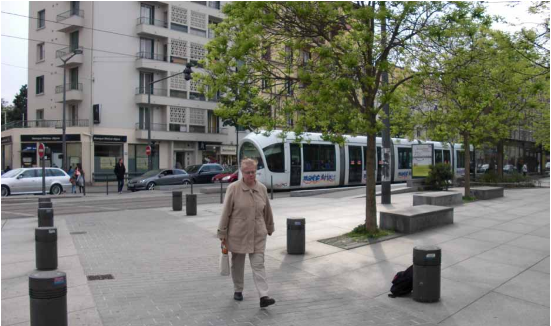
HIGH QUALITY PUBLIC REALM WITH CLEAR PEDESTRIAN ROUTES TO LRT LYON