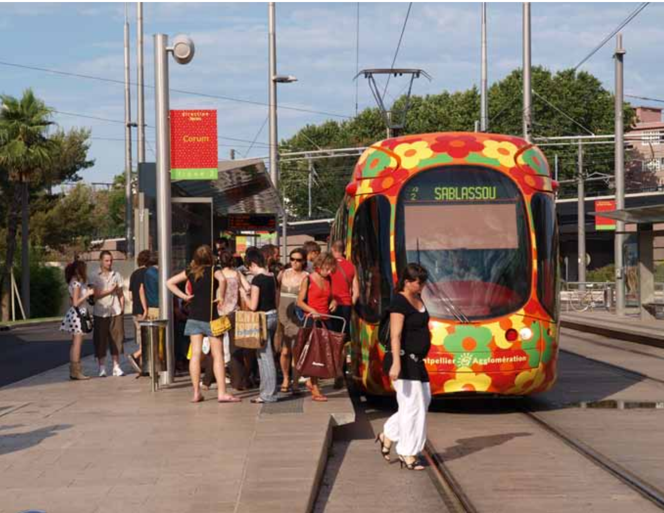
LRT ADDS TO URBAN LIFESTYLE MONTPELLIER

The design of the public realm is as important as the design of the transit facilities themselves, as it forms the physical link between transit and the existing and planned developments and communities. In this context, the public realm is defined as the space between and around buildings, in streets and squares, accessible and usable by people.