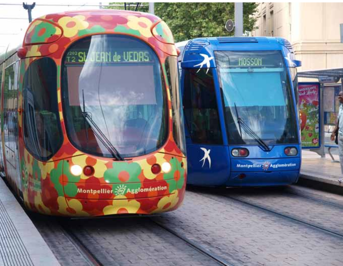
INDIVIDUAL LINES CAN HAVE DIFFERENT LIVERY MONTPELLIER