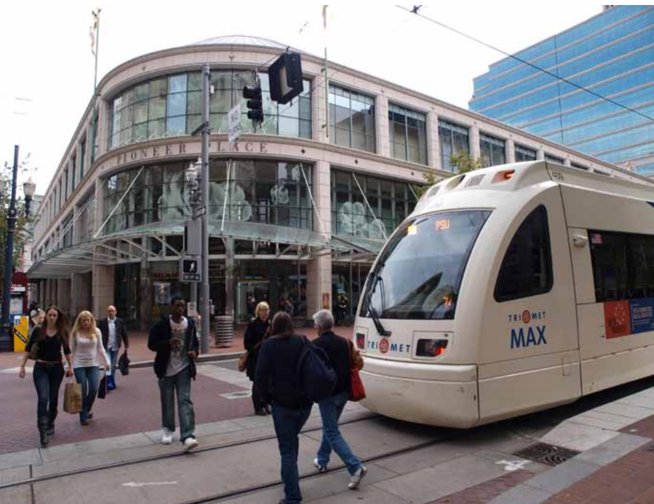
COMBINED USE OVERHEAD WIRES AND TRAFFIC SIGNALS PORTLAND

The design of the overhead line should take full account of the requirements of the public realm and the character and context of each location or section of the alignment.