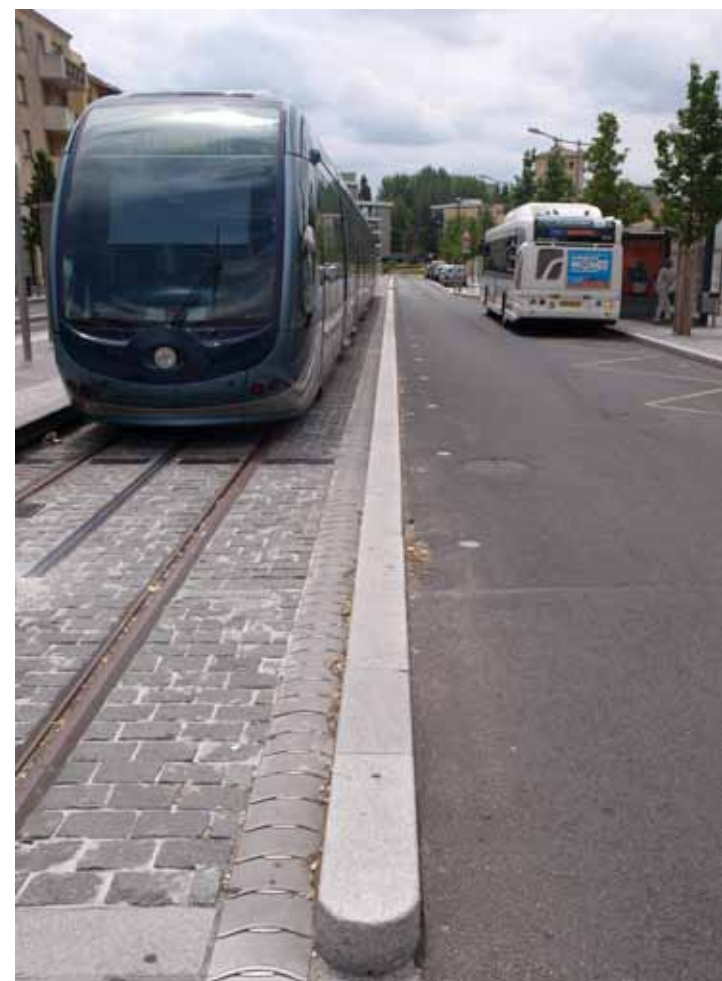
SURFACE FINISH AND CURB DETAILS DELINEATE THE LRT ALIGNMENT

Surfacing of the LRT track should complement and, if possible, improve the quality of paving of the street generally. The LRT swept path should be clearly delineated and differentiated by texture or by tone of colour from surrounding paving or road surfacing, particularly where LRT operations are not fully segregated from general traffic, such as at pedestrian, cyclist and road crossings.