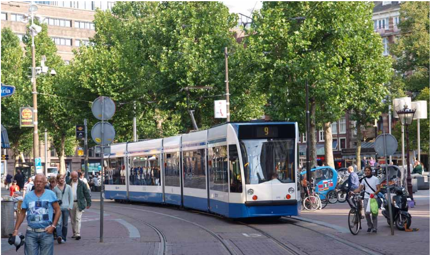
LRT IN PEDESTRIAN AREA AMSTERDAM