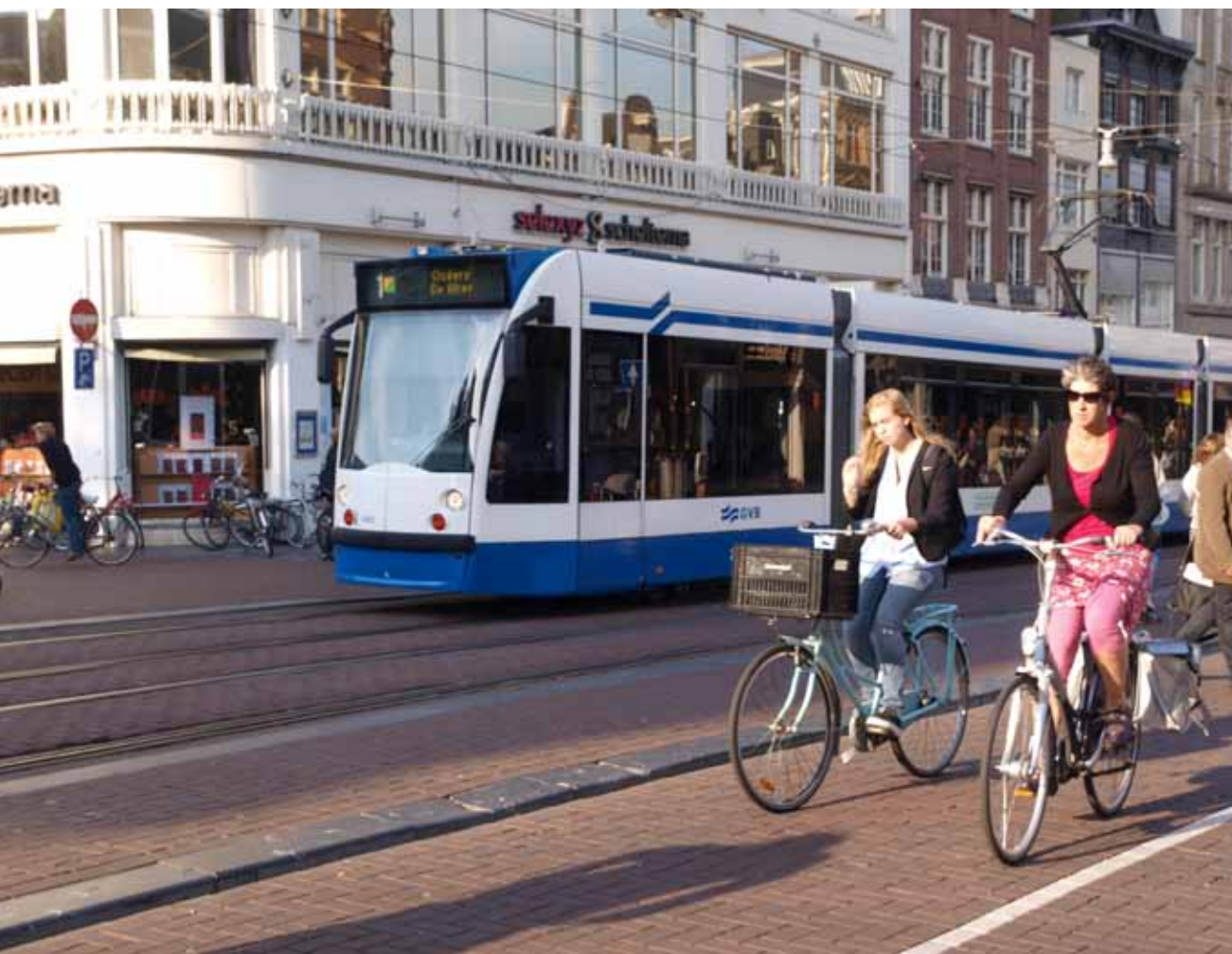
SEGREGATED CYCLE FACILITIES PREFERRED, WHERE SPACE ALLOWS AMSTERDAM