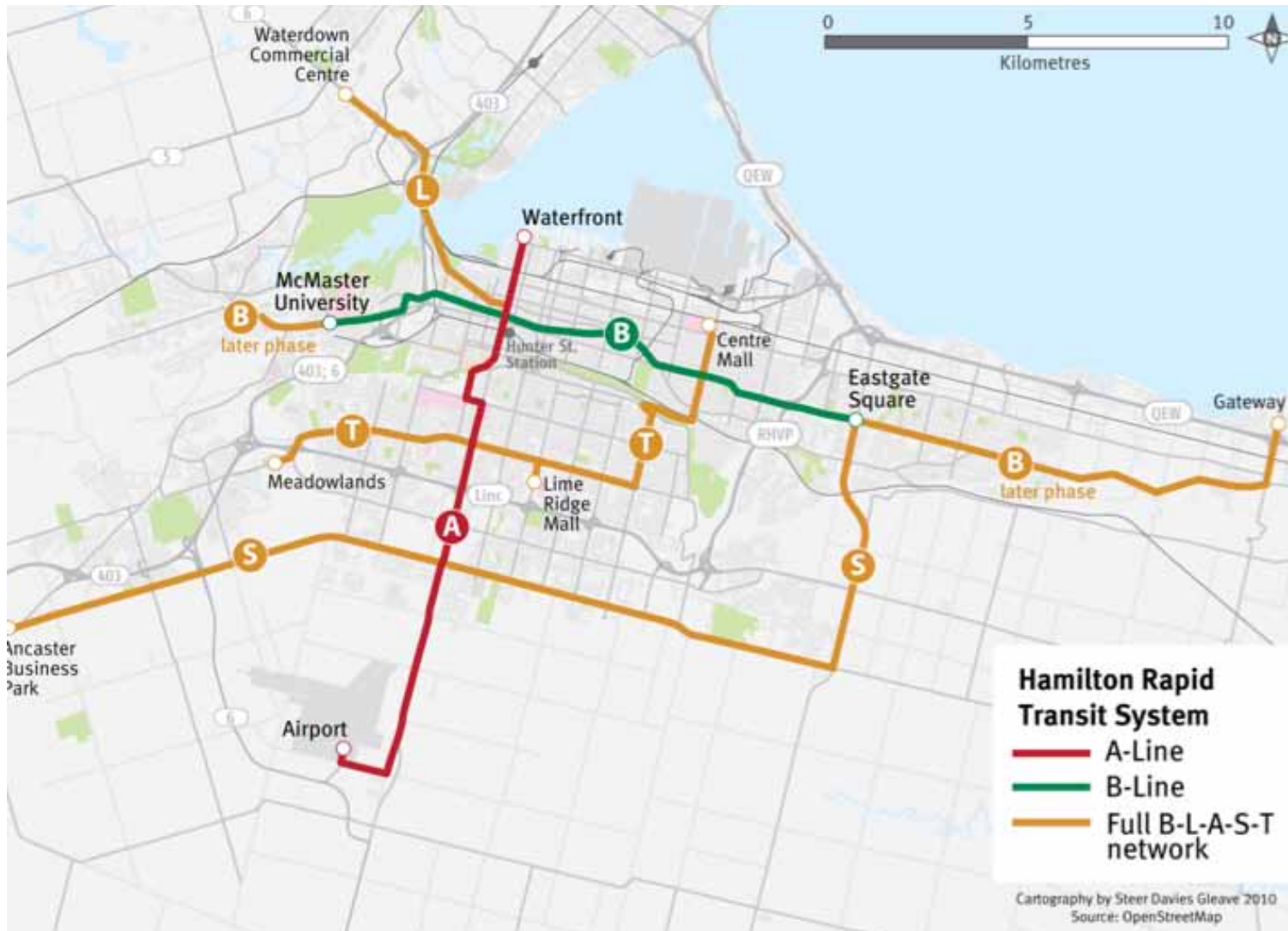
PROPOSED B-L-A-S-T NETWORK