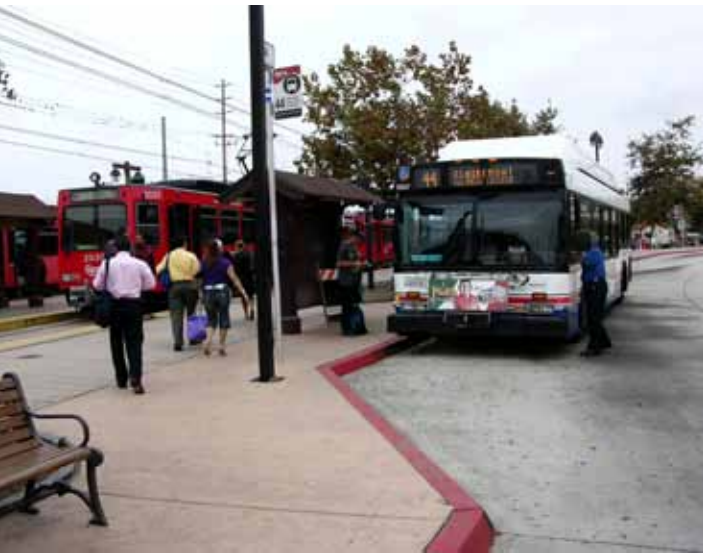
CROSS PLATFORM TRANSFER SAN DIEGO

For bus services which terminate at the LRT stop, a waiting and turning area should be provided at a location away from the LRT stop to prevent the loss of valuable (TOD) development opportunities. On-street bus stops should be located in positions with clear access to the LRT stop, with buses “stored” at a remote location until their timetabled arrival time. Passenger access facilities are not required at the bus waiting and turning area, and hence its size can be minimized.