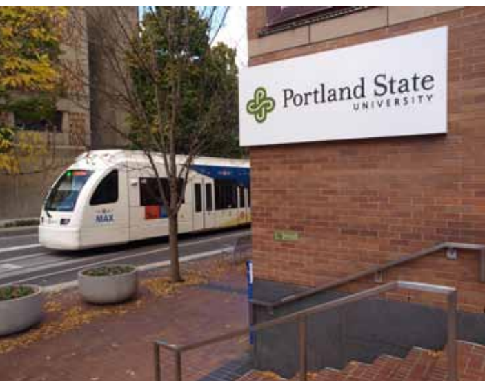
USING LRT TO ENHANCE EXISTING URBAN AREAS PORTLAND

Transit oriented development needs to create attractive, liveable, compact neighbourhoods with housing, jobs, shopping, community services and recreational opportunities within convenient walking distance of a node.