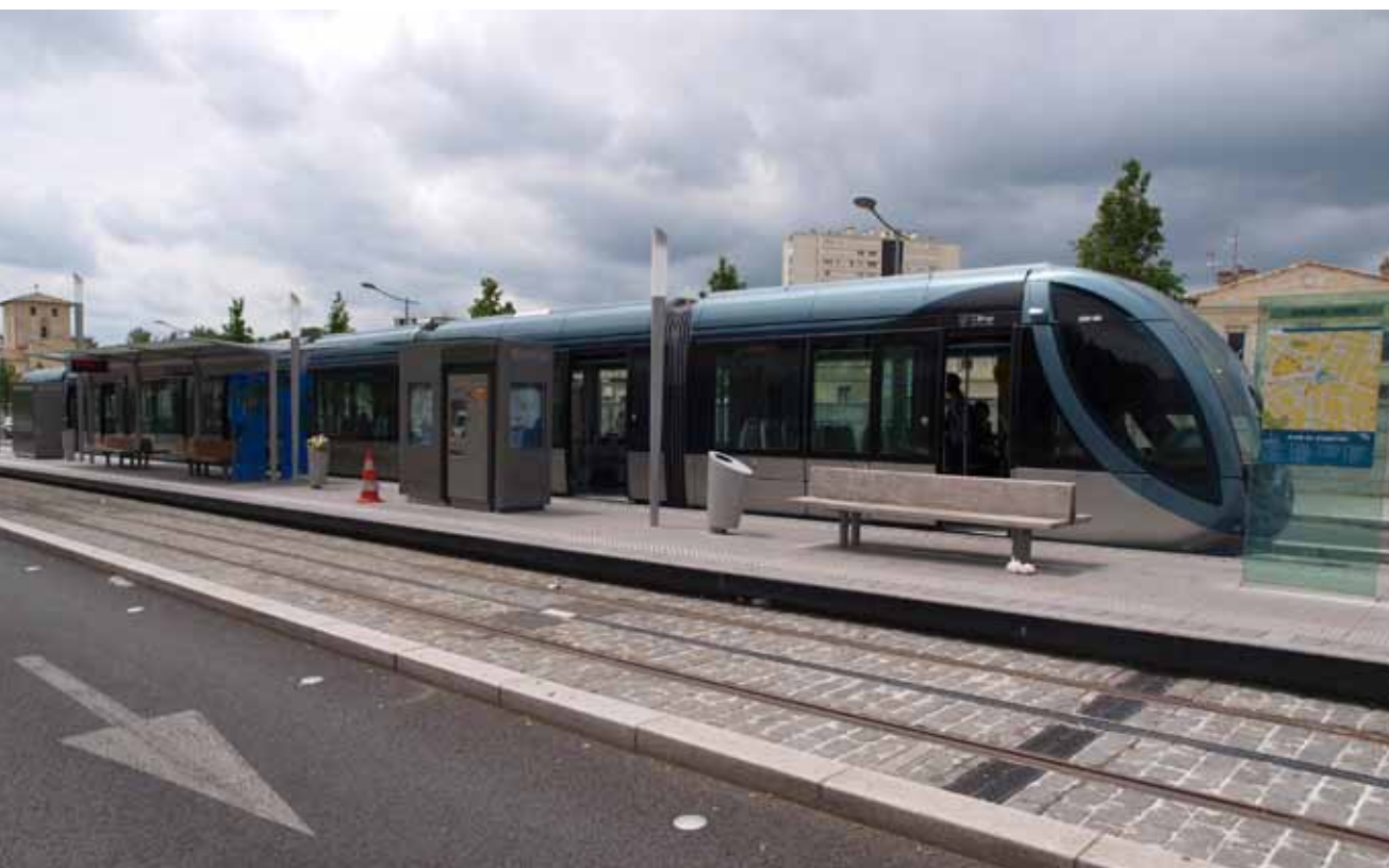
FULLY SEGREGATED ON-STREET RUNNING BORDEAUX