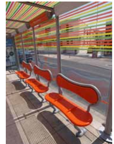
DISTINCTIVE SYSTEM IDENTITY MONTPELLIER