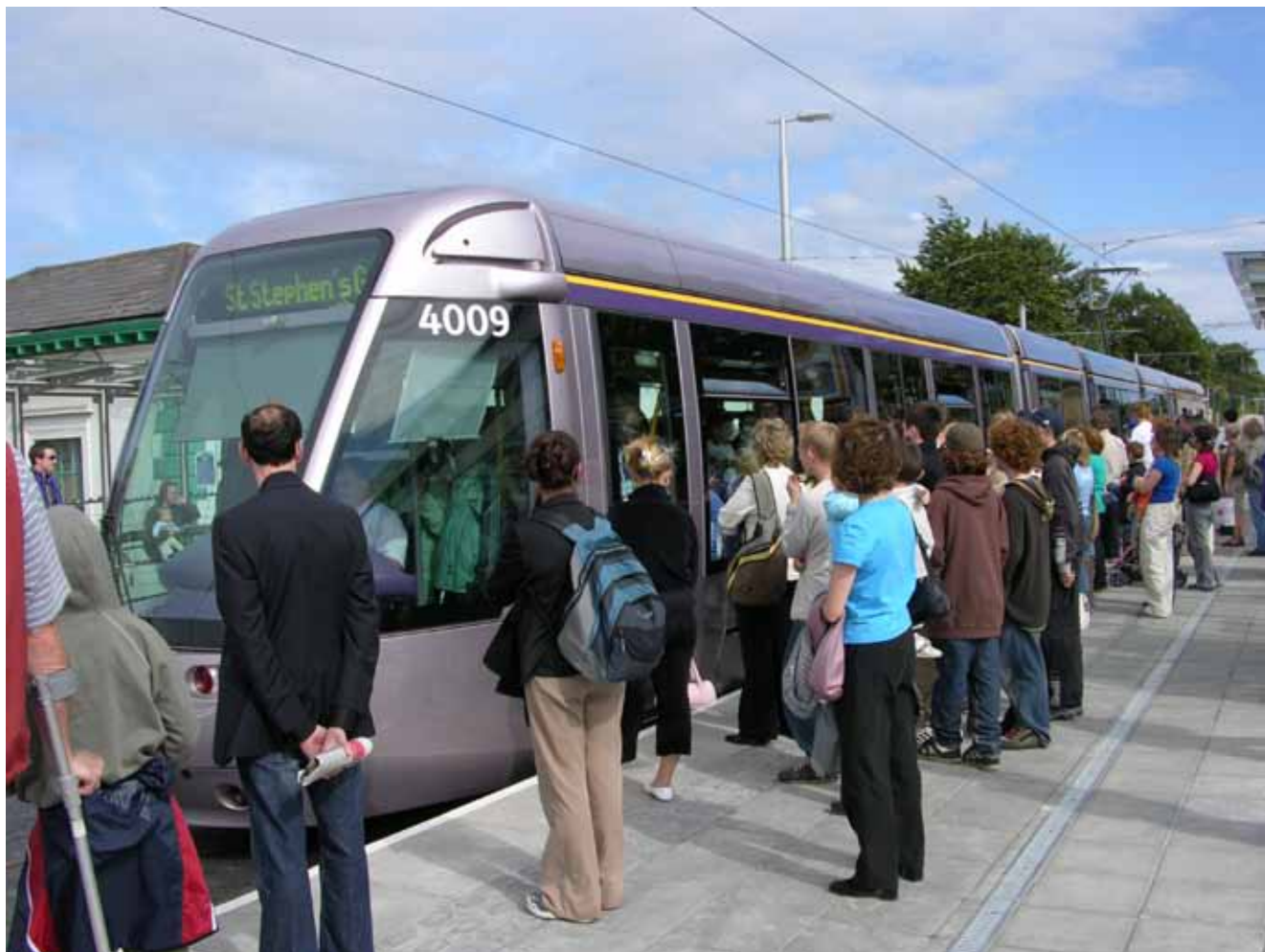
LRT IS AN ATTRACTIVE TRAVEL ALTERNATIVE

In response to the Rapid Transit Vision an integrated approach has been developed for the B-Line LRT corridor. This focuses on the development of a “complete street” design approach and the development of an LRT system designed to “put the passenger first” in terms of convenience, affordability, safety and efficiency.