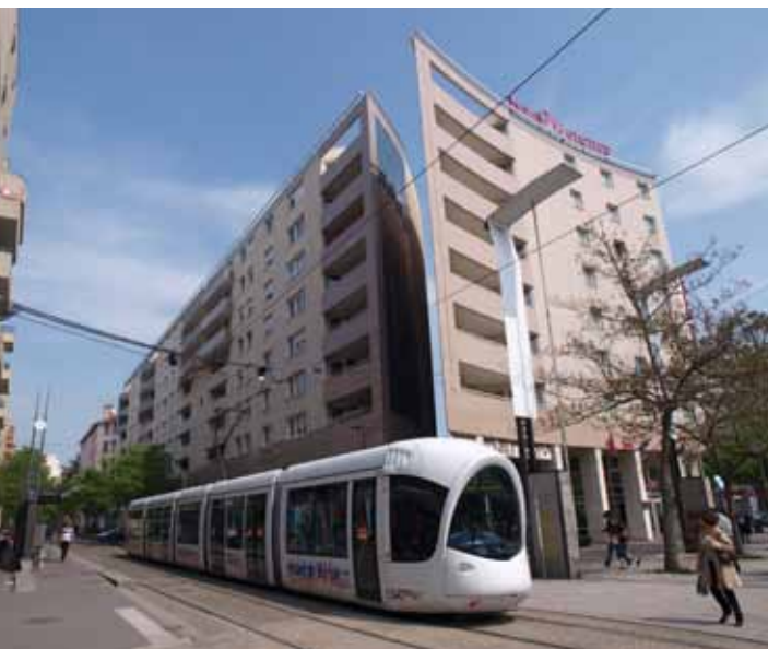
HIGH QUALITY URBAN DESIGN IS A KEY FEATURE LYON