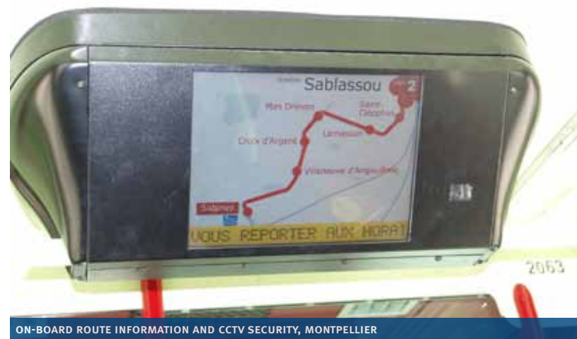
ON-BOARD ROUTE INFORMATION AND CCTV SECURITY, MONTPELLIER

Most modern vehicle manufacturers supply a range of standard products, which can be customised in terms of internal layout and fittings and external colour/livery. For LRT vehicles some manufacturers also offer options for external vehicle end styling and will consider bespoke designs to suit a particular City.