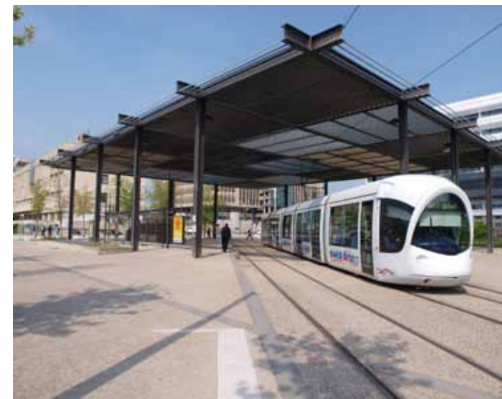
USING LRT TO CREATE A PLACE. UNIVERSITY CAMPUS LYON