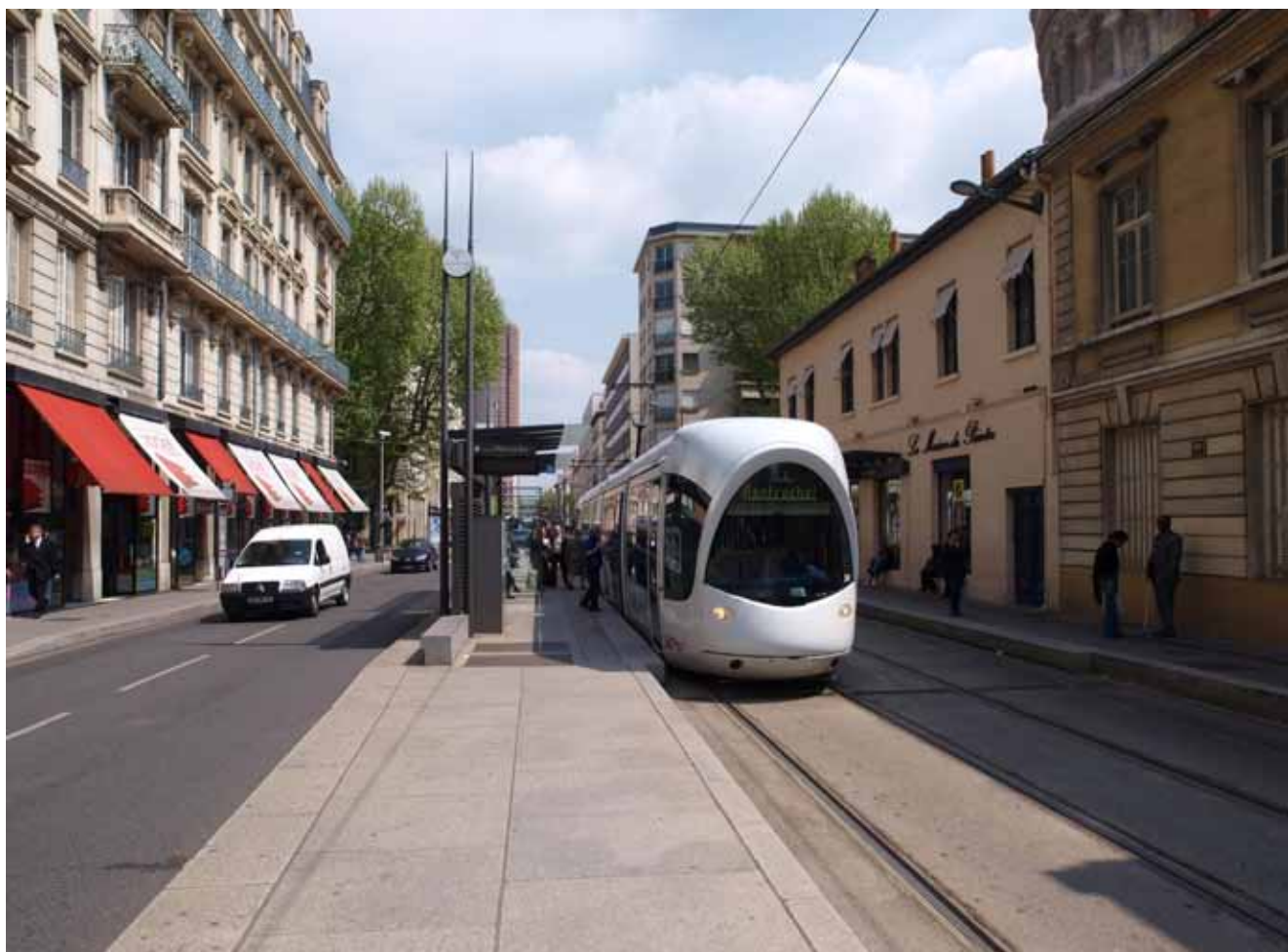
A COMPLETE STREET DESIGN INCLUDING URBAN STYLE LRT

This integration of LRT and land use planning requires a new approach to the development the LRT system components with a greater emphasis on urban design and the fit of the LRT components within the urban form. Amongst the most successful and best regarded LRT systems, particularly in Europe and North America, are those which have been designed as “complete streets”, fully integrated into the streetscape and public realm through which they pass and to which they add real value.