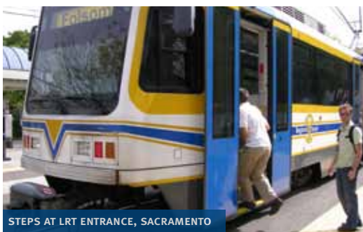
STEPS AT LRT ENTRANCE, SACRAMENTO

Due to the tighter street layouts commonly found in European cities, and the greater difficulty in designing LRT into these streetscapes, the approach to LRT system design has been more integrated, leading to an approach termed “Urban style LRT”. Over the last 20 years this has become a common standard for many of the modern LRT systems around the World.