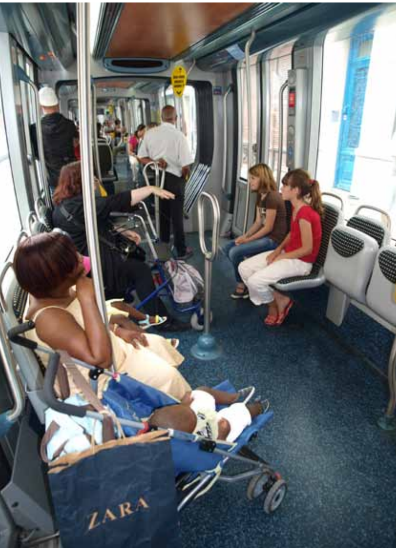
LRT INTERIOR PROVIDES FLEXIBLE SPACE BORDEAUX

The vehicle should be equipped throughout with sufficient handholds to enable people to stand throughout. The vehicle interior should be simple and practical, with light colours employed to improve the perception of space.