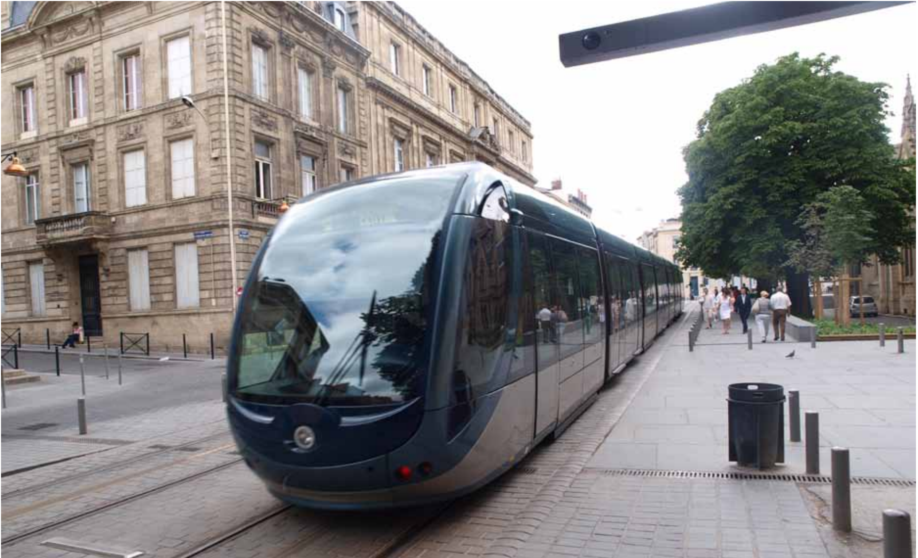
URBAN STYLE LRT DESIGN- FLUSH TRACK, ALIGNMENT TEXTURE, LANDSCAPING, AND BARRIER-FREE LEVEL SURFACES ALL CONTRIBUTE TO A HIGH QUALITY DESIGN BORDEAUX