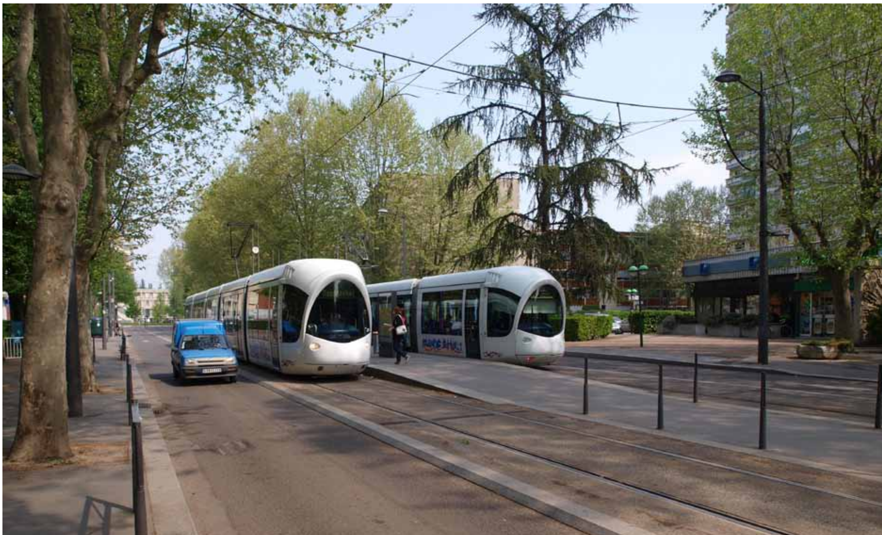
PARTIALLY SEGREGATED ON-STREET RUNNING