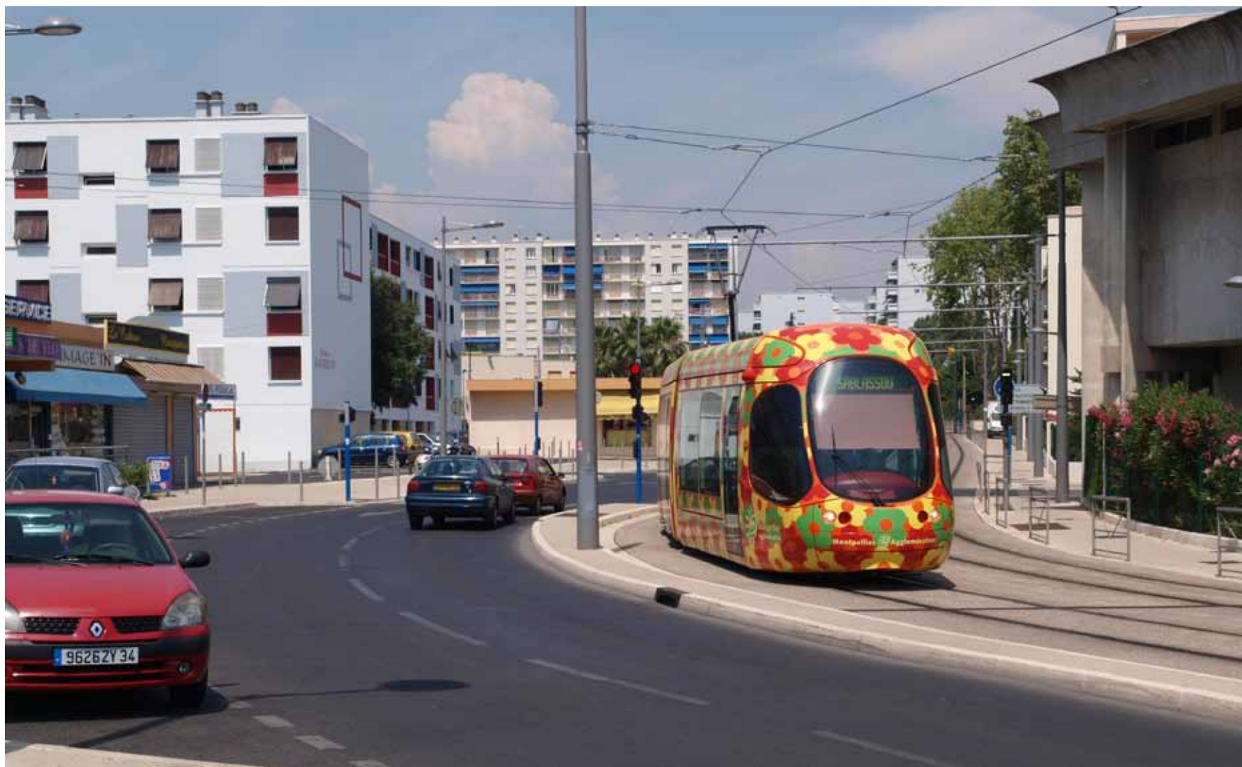
COMPLETE STREET URBAN STYLE LRT- CURB-SEGREGATED LRT, RE-ALLOCATED ROADS SPACE INCLUDING STREET PARKING MONTPELLIER