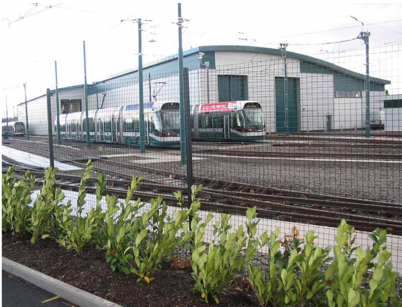
HIGH QUALITY MSF DESIGN INCLUDING SYSTEM BRANDING AND LANDSCAPING NOTTINGHAM

The stabling sidings may be open or enclosed, depending on local environmental and climatic factors. An enclosed stabling area will significantly