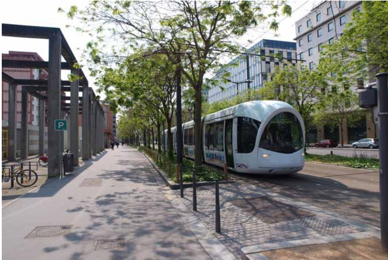
USING SURFACE TEXTURES AND LANDSCAPING TO ZONE THE STREETScape