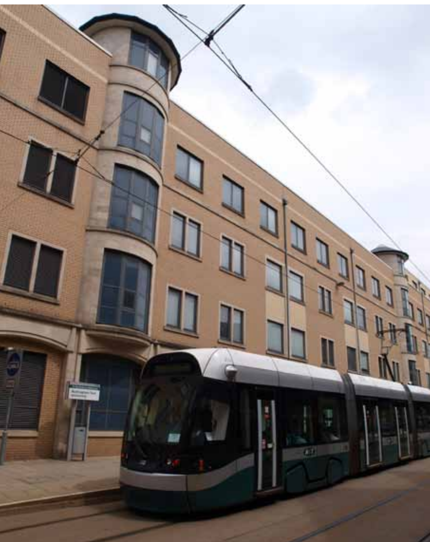
OVERHEAD WIRES ATTACHED TO BUILDINGS REDUCES CLUTTER NOTTINGHAM