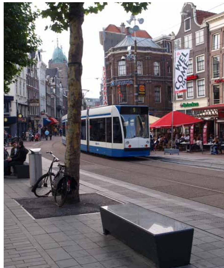
INTEGRATING LRT WITH LANDSCAPING AND HIGH QUALITY URBAN DESIGN AMSTERDAM