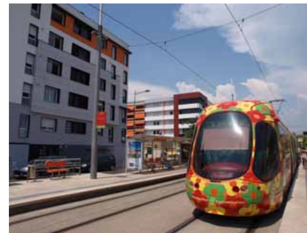
LOW FLOOR STOP INTEGRATED WITH SURROUNDING DEVELOPMENT MONTPELLIER