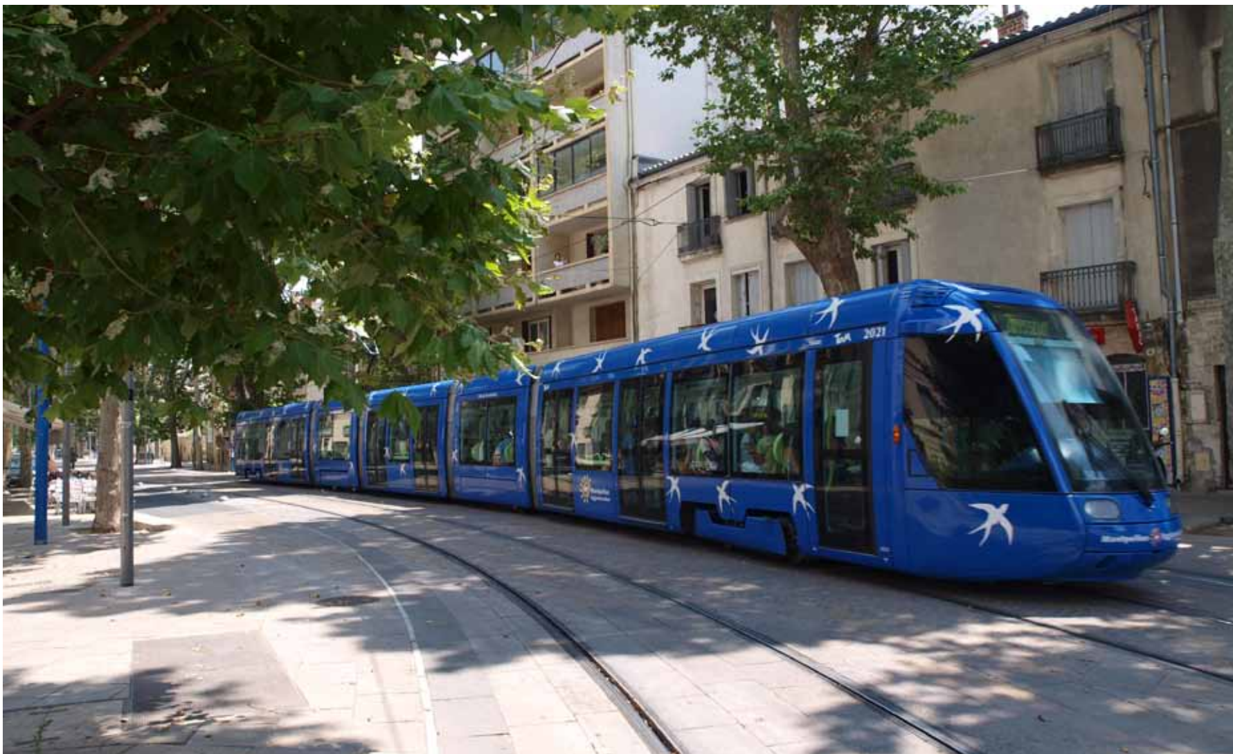
MODERN URBAN STYLE LIGHT RAIL VEHICLE MONTPELLIER