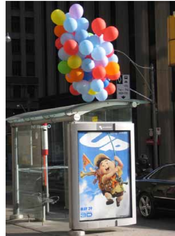
INNOVATIVE STOP ADVERTISING

Accessibility to stops will be optimised where barriers to pedestrian movement are minimized. In Downtown areas the preferred design solution for the B-Line is for LRT rails flush with the road surface where pedestrians can cross the street without pedestrian guardrails or similar obstructions.