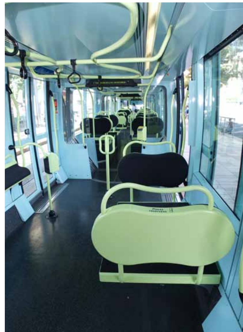
HIGH QUALITY INTERIOR DESIGN FOR LRT MONTPELLIER

Comfortable - Vehicles should provide a well-lit, temperature-controlled environment. The internal layout should provide for seating, facilities for strollers and wheelchair users and standing passengers. An internal aisle along the length of the vehicle should be provided to allow people to move within the vehicle. Doors should automatically close when not in use. The seating where possible should be cantilevered from the vehicle sides to aid cleaning, with flip down seating or rests employed in stroller and wheelchair zones when they are not being utilized.