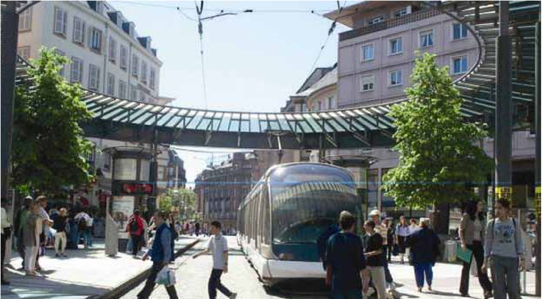
A DOWNTOWN LRT STOP BECOMES A FOCAL POINT STRASBOURG