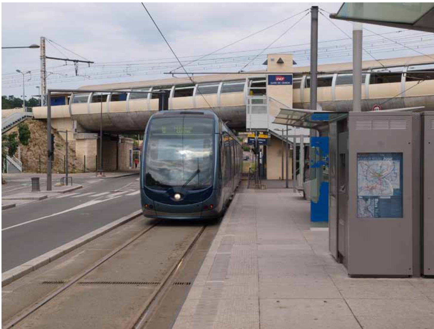
TRACKSIDE POWER CABINETS INTEGRATED INTO STOP DESIGN