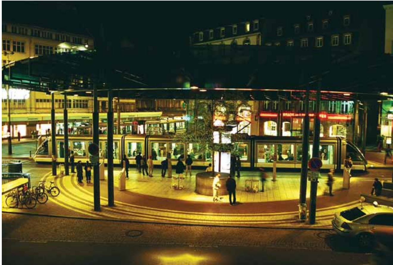
HIGH QUALITY LIGHTING CAN ENHANCE LRT STOP APPEARANCE