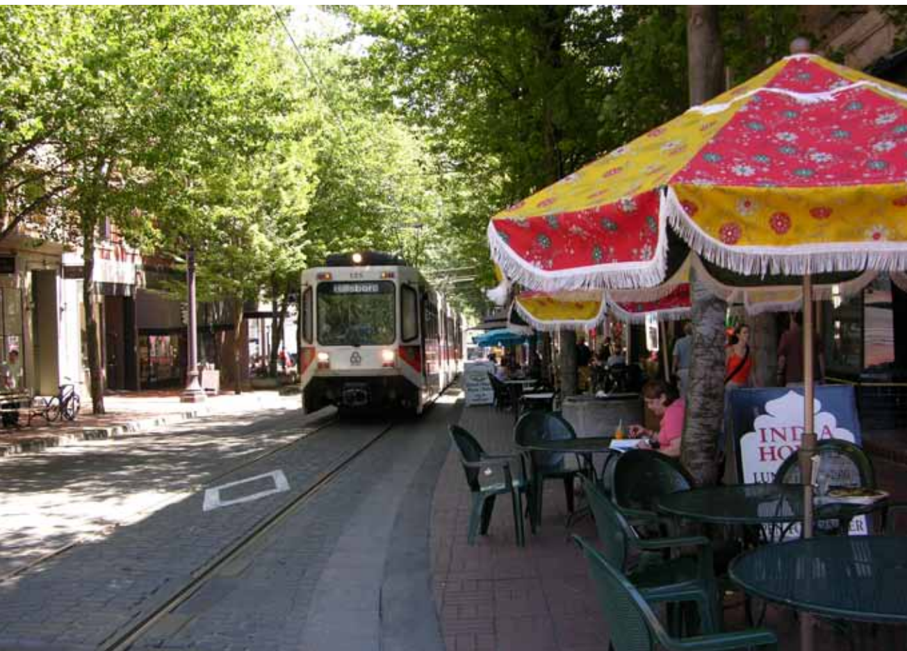
URBAN STYLE LRT INTEGRATED INTO THE STREETScape PORTLAND