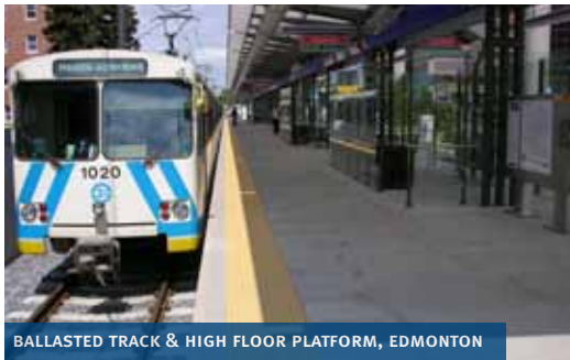
BALLASTED TRACK & HIGH FLOOR PLATFORM, EDMONTON