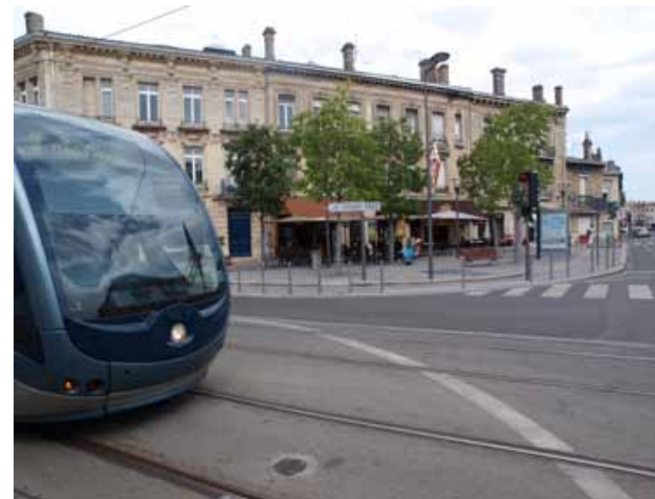
COMPLETE STREET DESIGN INCLUDES URBAN DESIGN AT JUNCTIONS BORDEAUX

Trees and landscaping can provide an enlivening of the street scene as well as enclose and reduce the impact of traffic on the residential and commercial buildings. New planting and complementary design and positioning of LRT features, such as masts, lights and stops, should seek to enhance the local street scene. Each section of route should be individually assessed and options and opportunities explored and identified to enhance their inherent qualities.