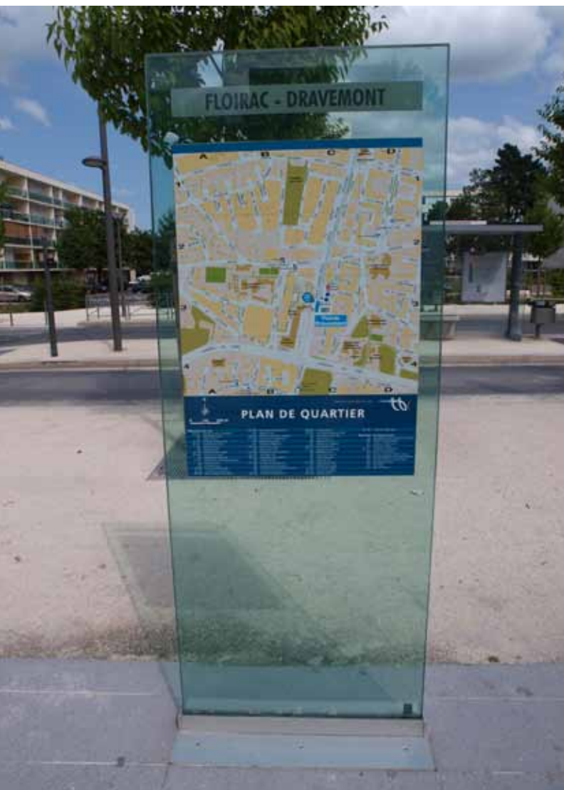
LOCAL AREA MAPS AT LRT STOPS BORDEAUX