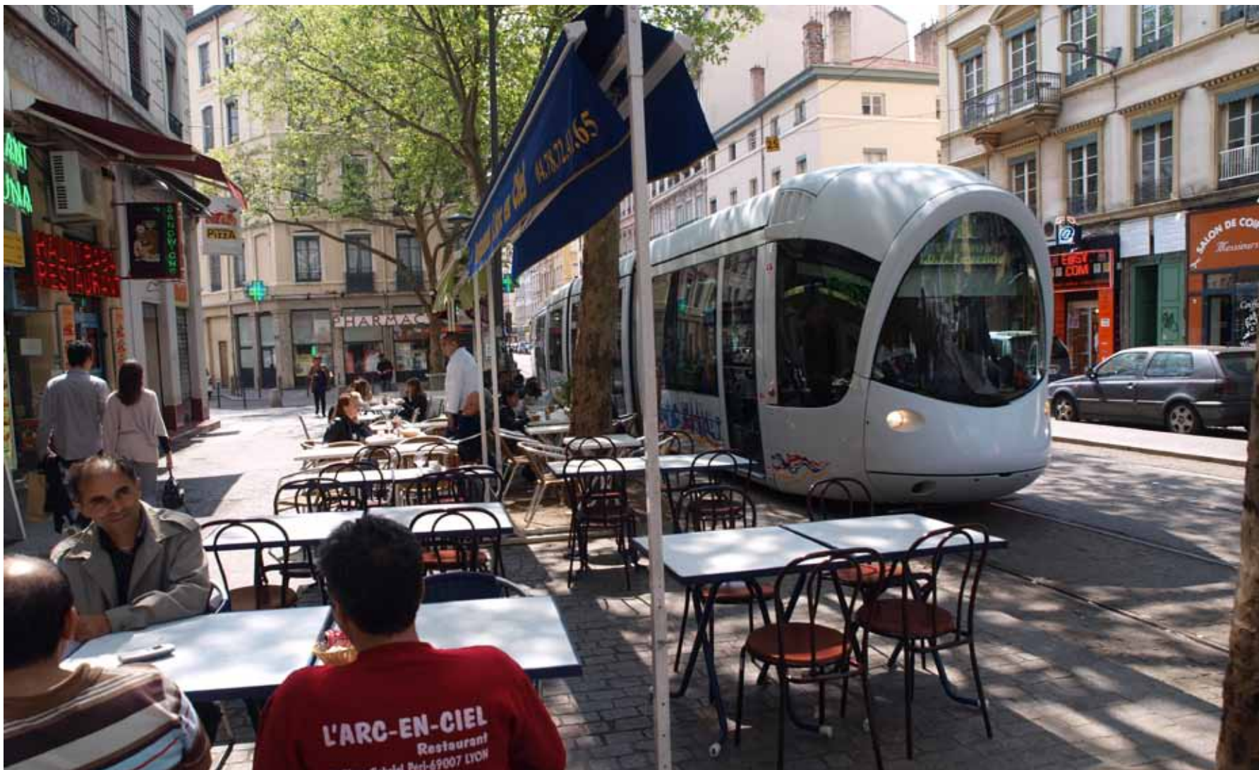
AN INTEGRATED DESIGN APPROACH RESULTS IN A CIVILIZED STREETSPACE LYON