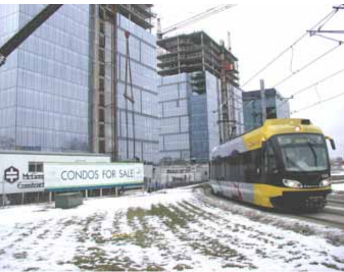
CLIMATIC FACTORS ARE AN IMPORTANT DESIGN CONSIDERATION MINNEAPOLIS