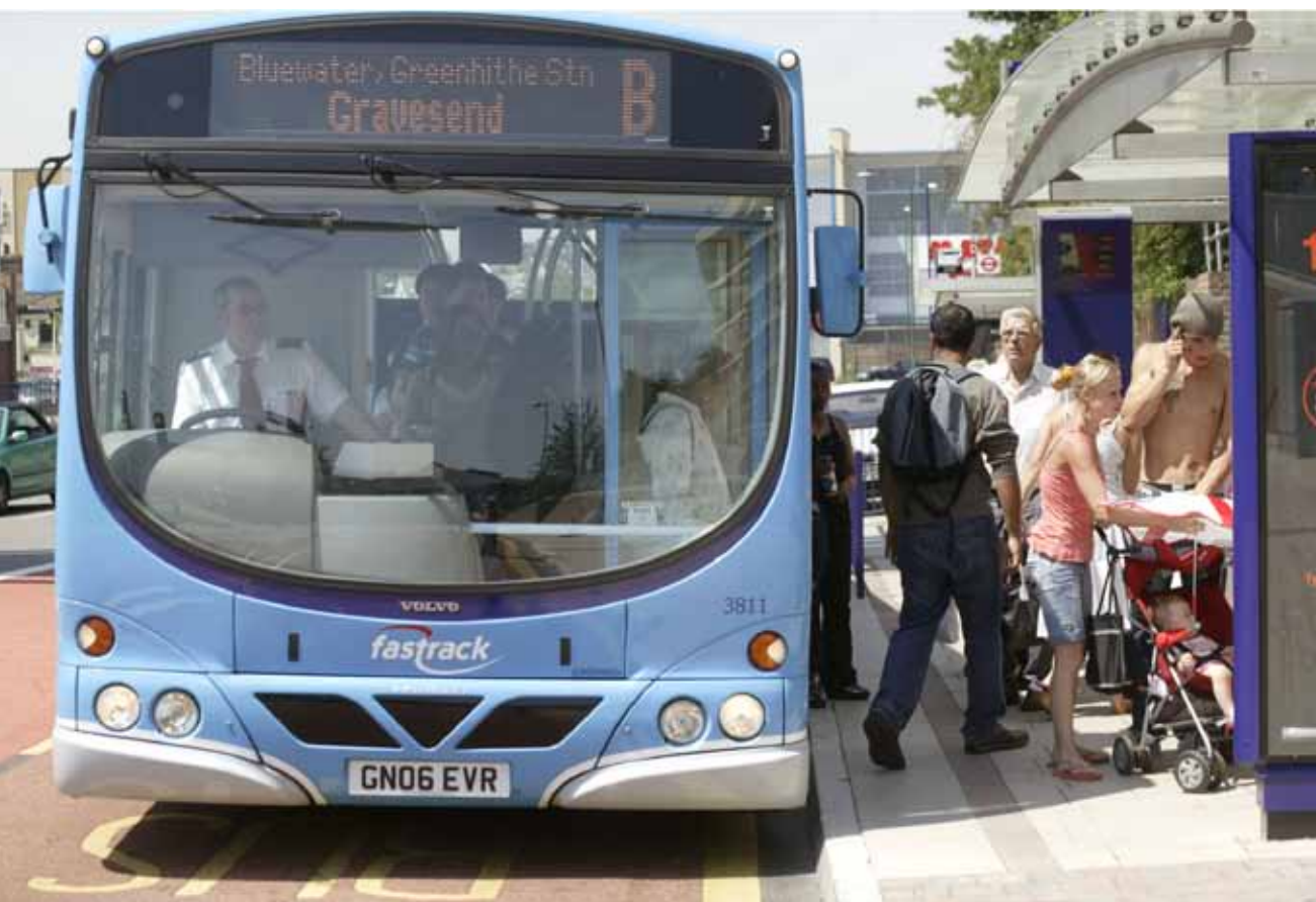
MODERN BUSES CHARACTERIZE BRT SYSTEMS