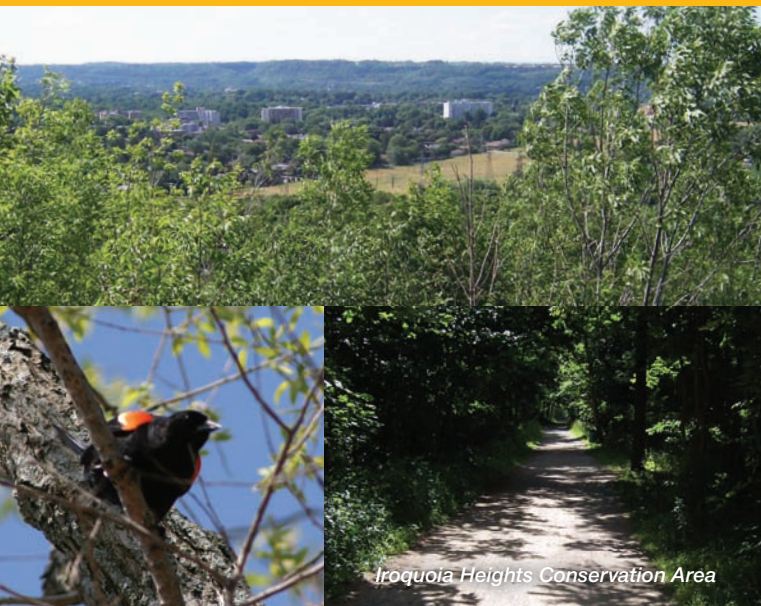
Iroquoia Heights Conservation Area

Albion Falls, views from the brow, Concession St shops, Sanatorium Falls, Iroquoia Heights, Ancaster shops