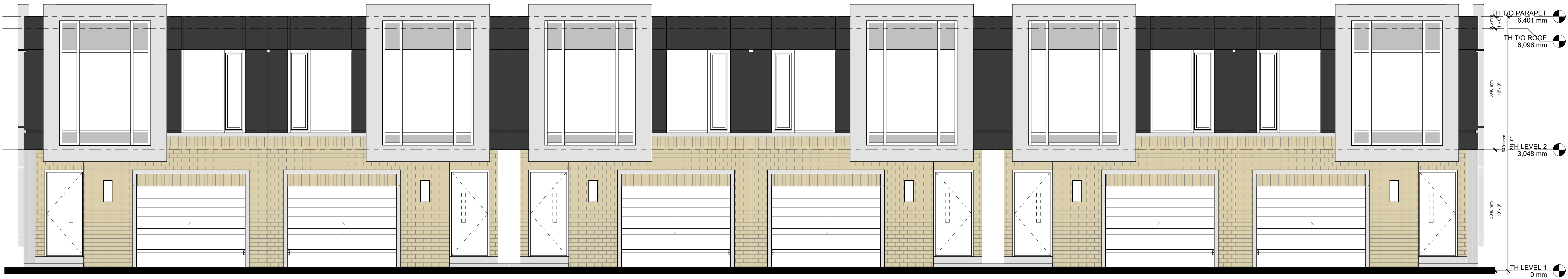
1 TOWNHOUSE FRONT ELEVATION A.305 1:50