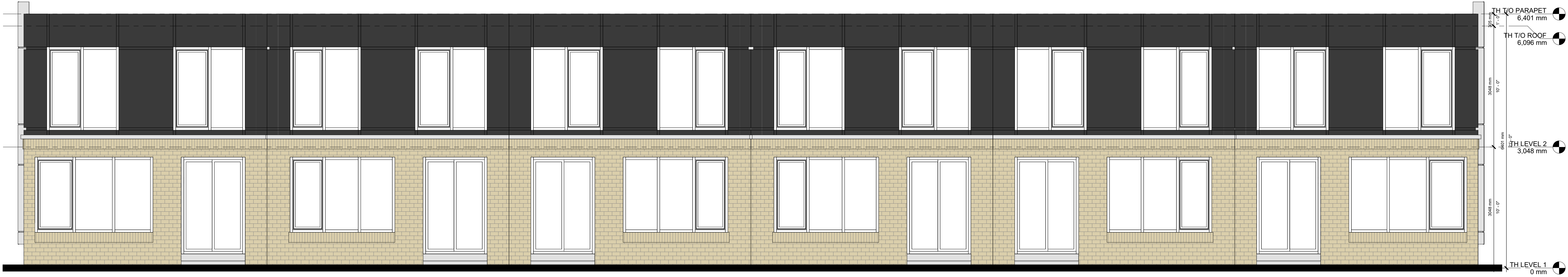
2 TOWNHOUSE REAR ELEVATION A.305 1:50