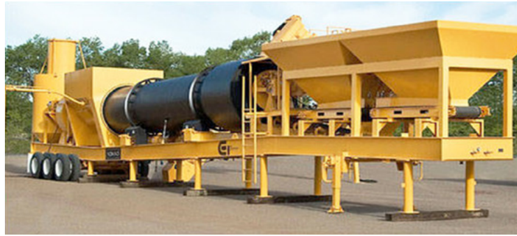
■ Above: Portable Hot Mix Asphalt Plant

The focus is on work practices to reduce gaseous emissions from portable hot mix asphalt plants that occur from the combustion process. Gaseous emissions include Sulfur Oxides (SO x ), NO x , Carbon Monoxide (CO) and VOC's. The various work practices outlined below have been summarized from the document published by the Canadian Construction Association 3 .