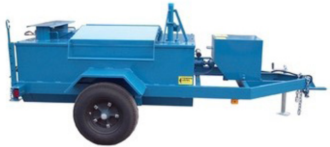
■ Above: A roofing kettle

VOCs are emitted from the installation and repair of asphalt roofs on commercial and industrial buildings, specifically from roofing kettles. A roofing kettle is a device used to heat and melt asphalt or coal tar pitch so that it can be applied onto a rooftop to provide a protective coating. To limit VOC emissions: