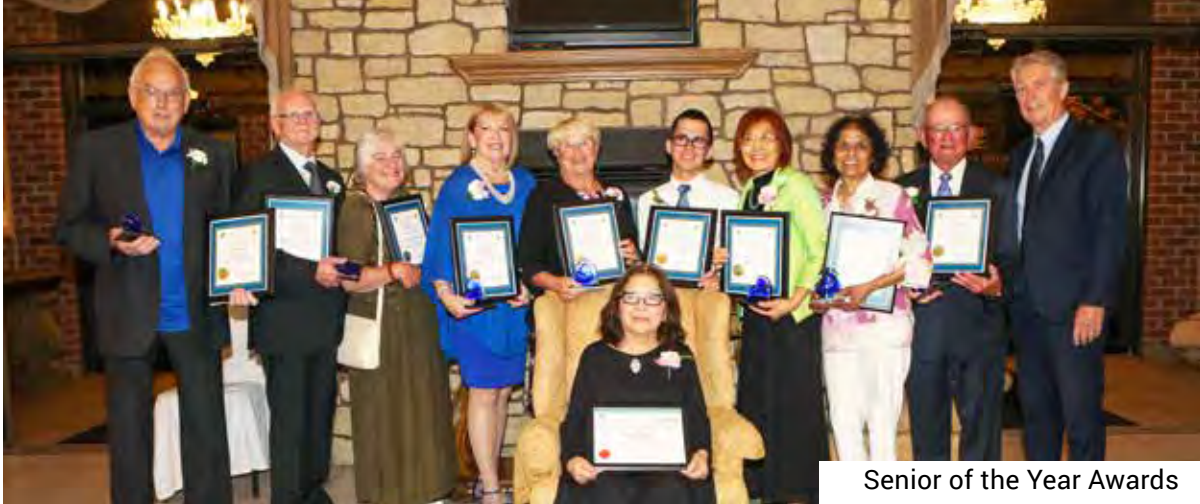
Senior of the Year Awards