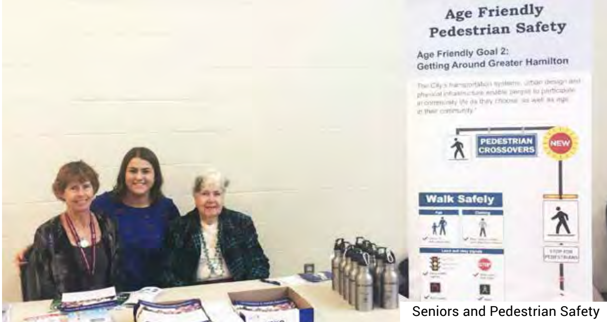
Seniors and Pedestrian Safety