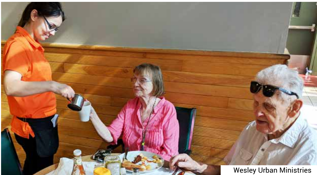
Wesley Urban Ministries