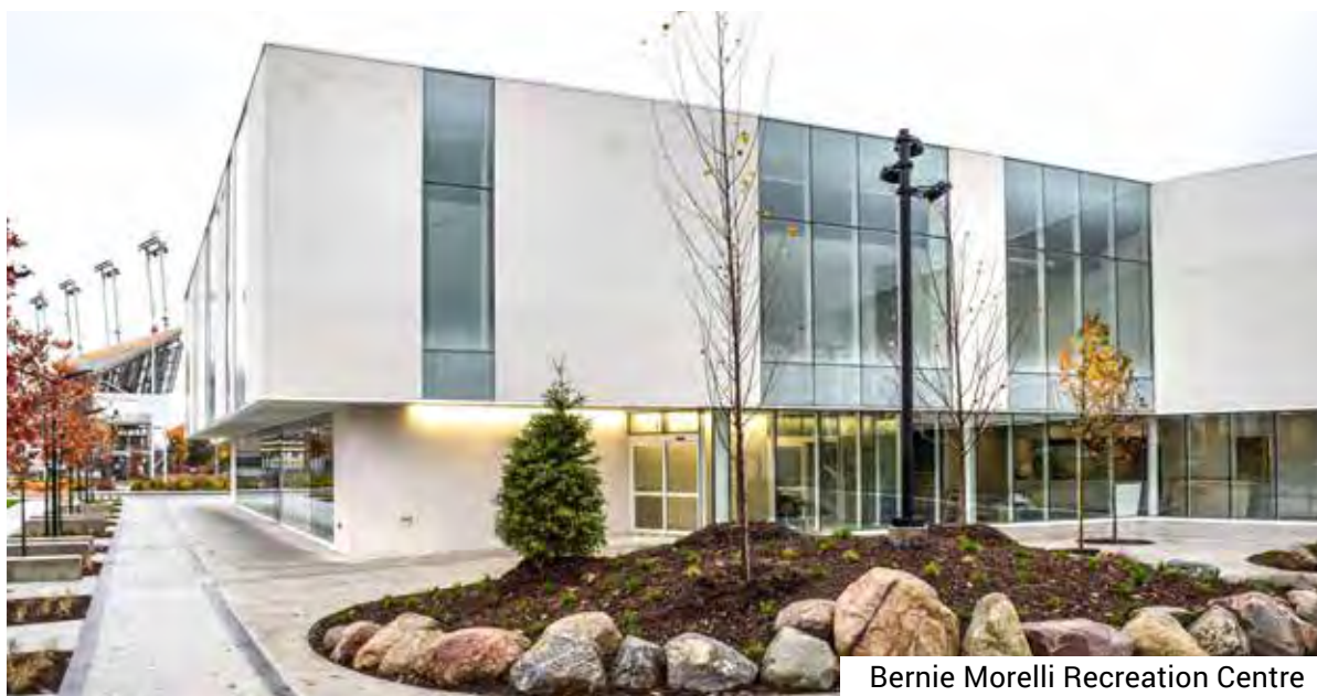
Bernie Morelli Recreation Centre