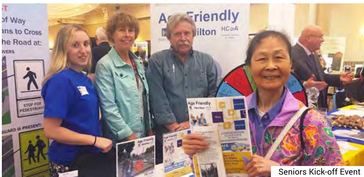
Seniors Kick-off Event