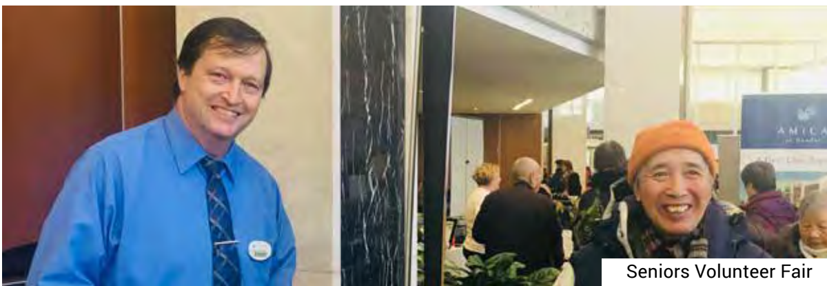
Seniors Volunteer Fair