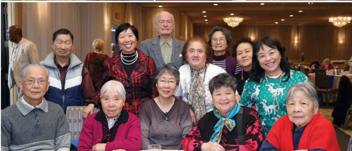
Age Friendly Symposium