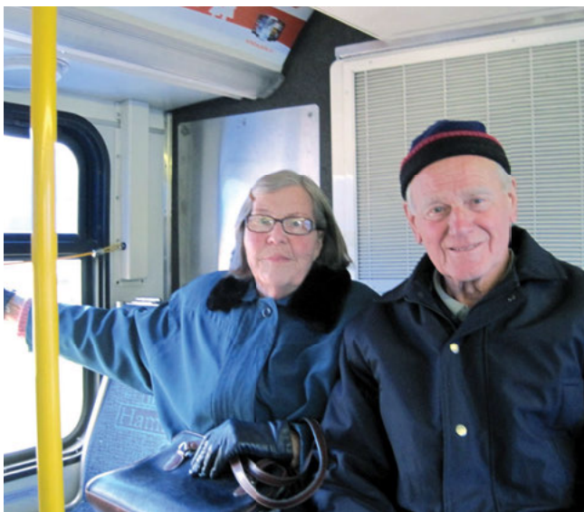
Let's Take the Bus workshop