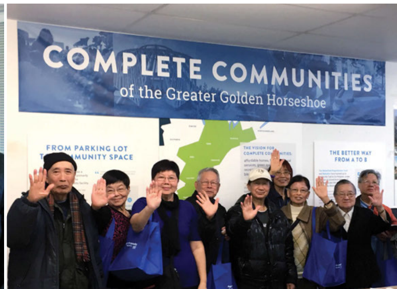
Pedestrian safety workshop