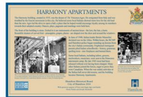
Heritage Recognition: 60 x 45 cm