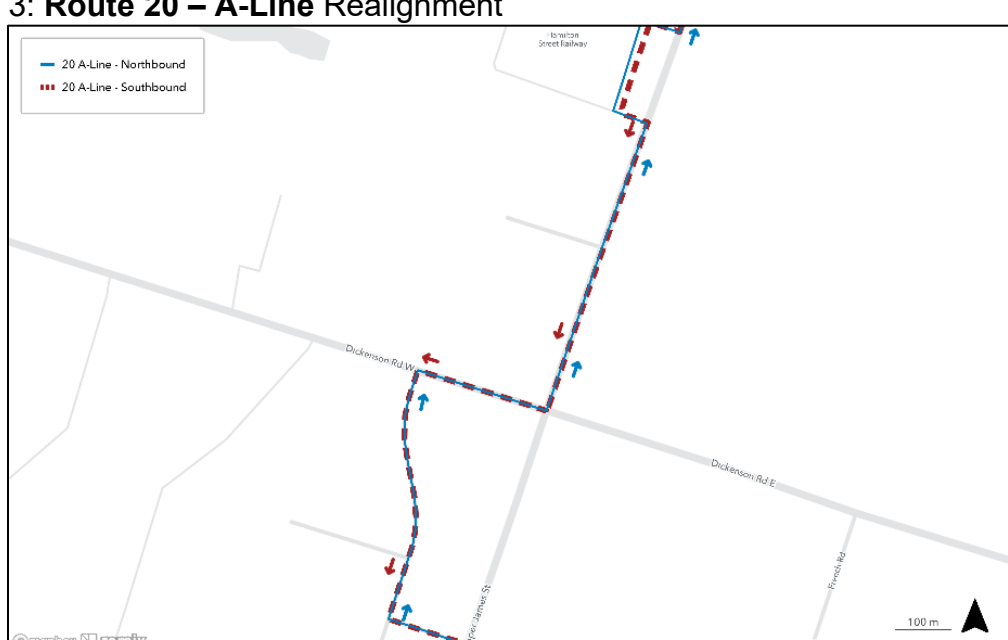
Figure 3: Route 20 - A-Line Realignment