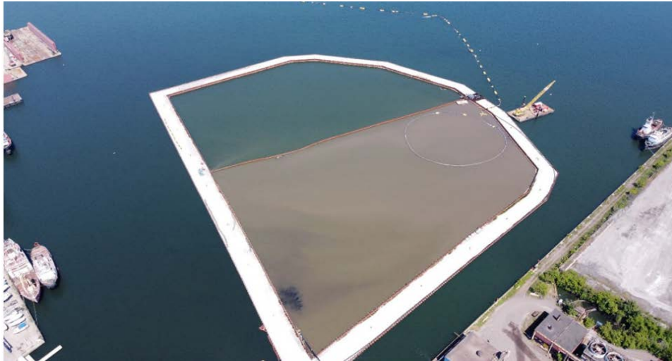
June 16, 2020 ECF overview showing complete wall structure and dredge pipeline

You can obtain further information about the project on-line by visiting www.randlereef.ca . A couple of photos from 2020 are provided below: