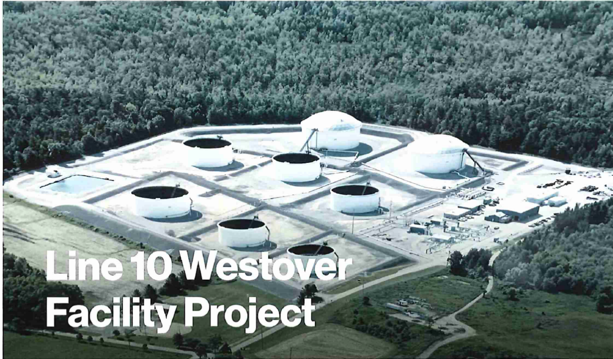
► A bird’s-eye view of Enbridge’s Westover Terminal. With the sale of Line 10 completed in June 2020, we are finalizing engineering plans for new assets, both within and adjacent to the Westover Terminal property, to allow the new owner of Line 10 to operate independently.

With the Enbridge sale of Line 10, we are beginning the process of constructing a small crude oil handling facility to enable the new owner to operate the pipeline independently of Enbridge’s Westover Terminal in Hamilton, Ontario.