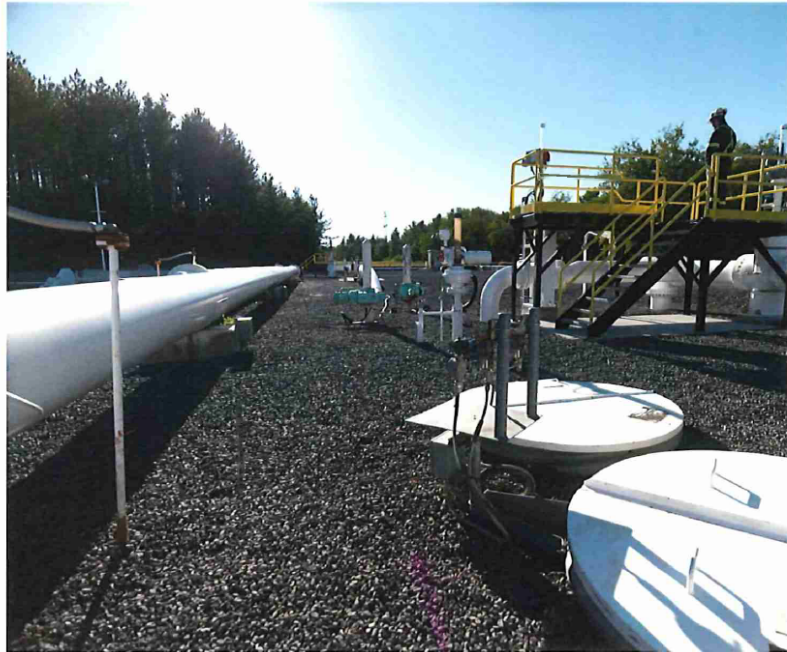
➤ To ensure a seamless transition of ownership, Enbridge will continue to operate Line 10 until at least 2023, under the ongoing oversight of the CER.

In May 2019, the CER approved the sale of Line 10. Under the terms of our sale agreement with URC, highly trained Enbridge personnel will continue to monitor the pipeline around-the-clock and rigorously maintain it using proven inspection and monitoring technology.