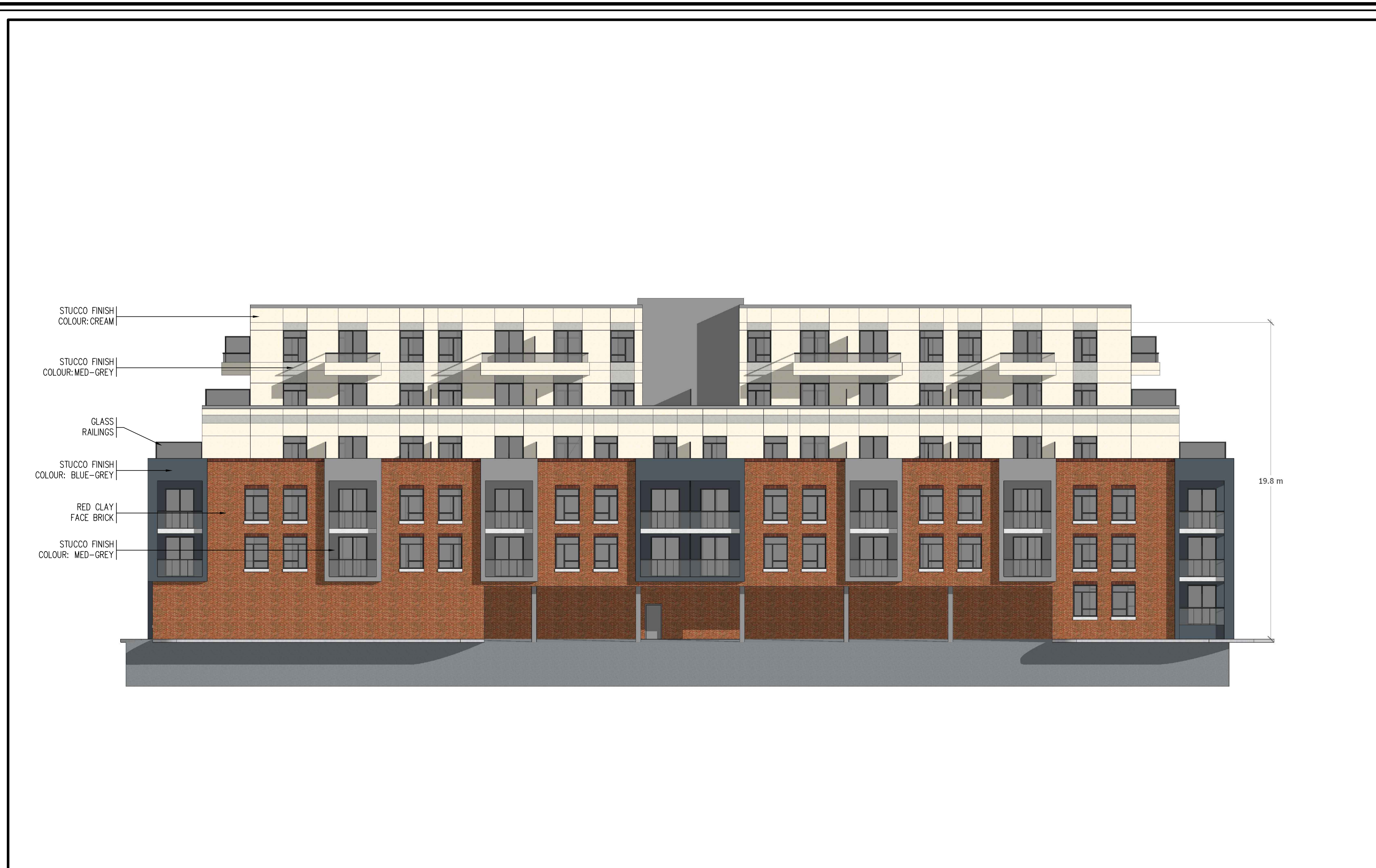
2 WEST ELEVATION A3.0 SCALE 1:200