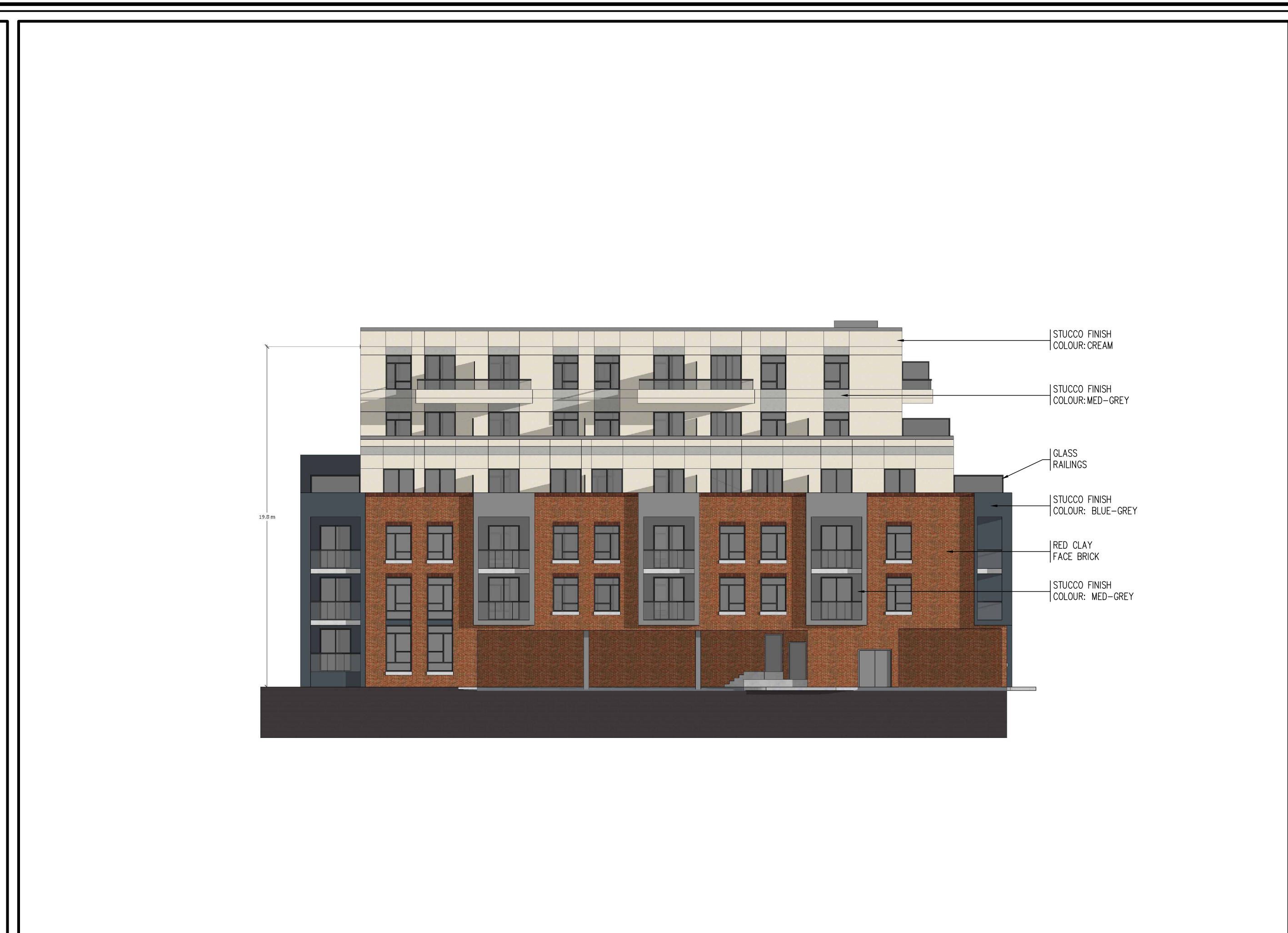
4 NORTH ELEVATION A3.0 SCALE 1:200