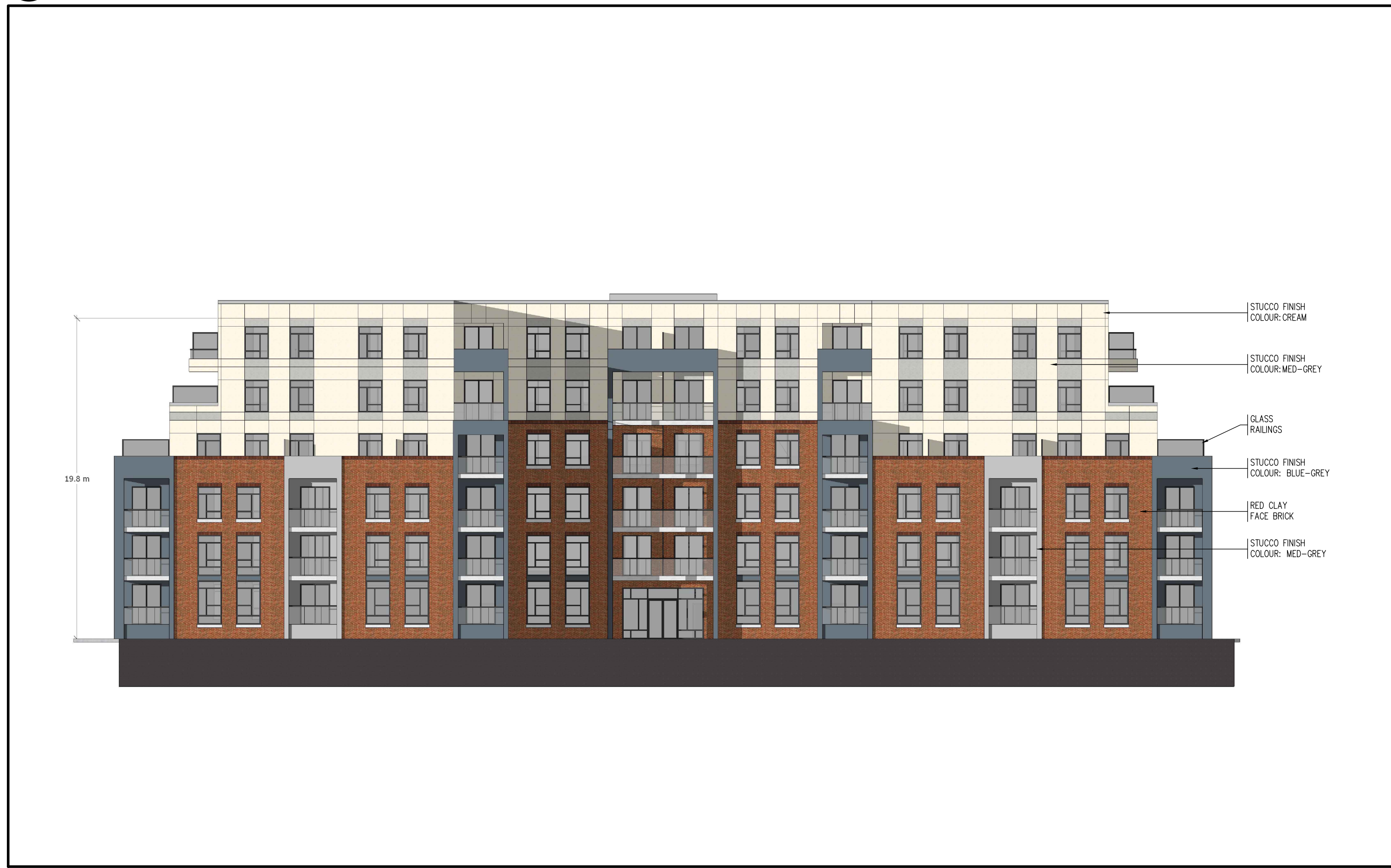
1 EAST ELEVATION A3.0 SCALE 1:200