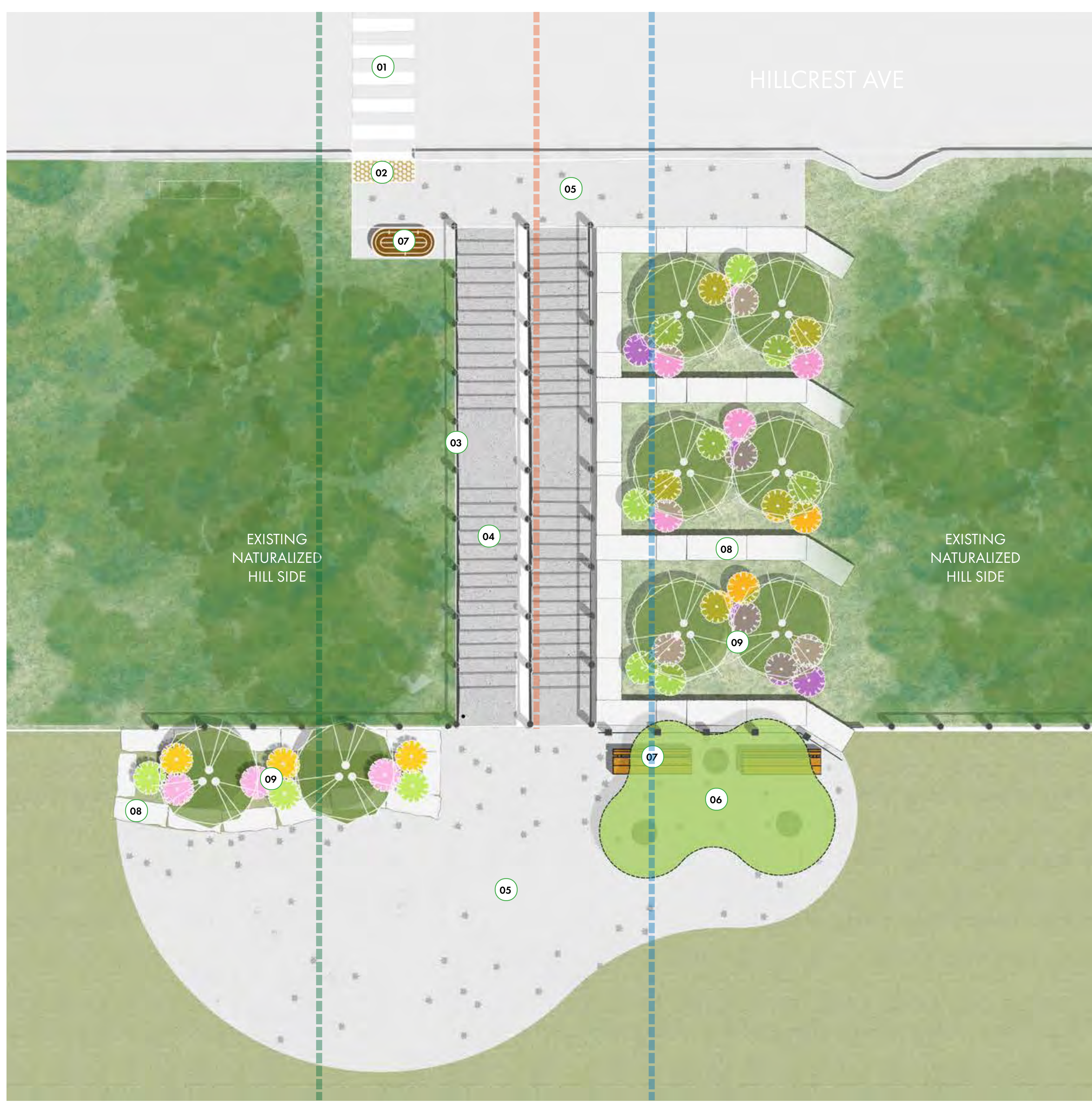
Artist rendering. Actual design may differ