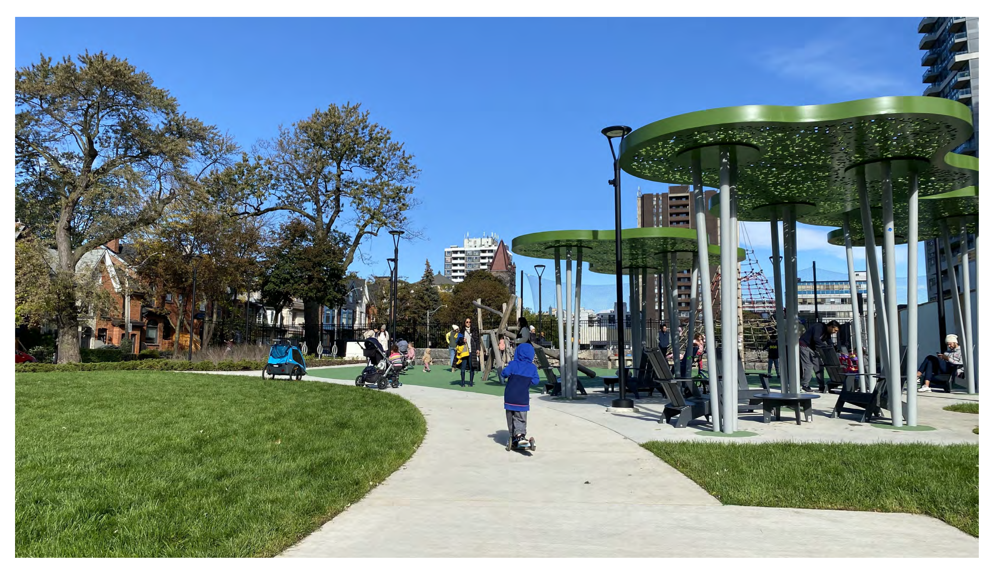
(01) CUSTOM ORGANIC SHAPE PERGOLA