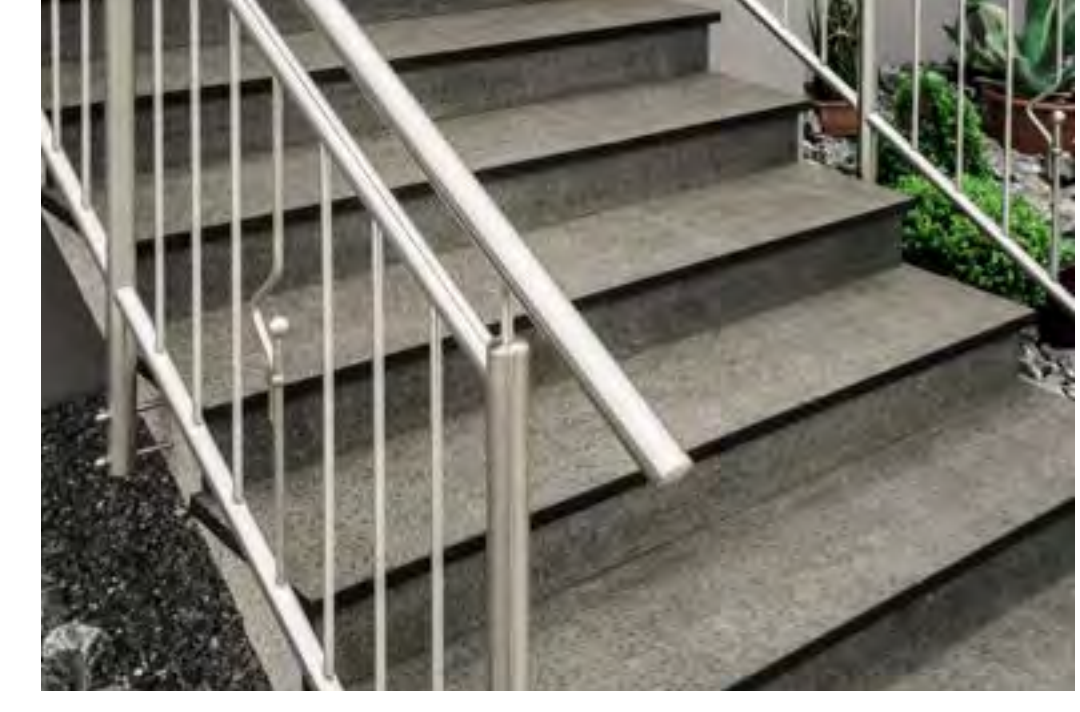
O7 SITE FURNITURE