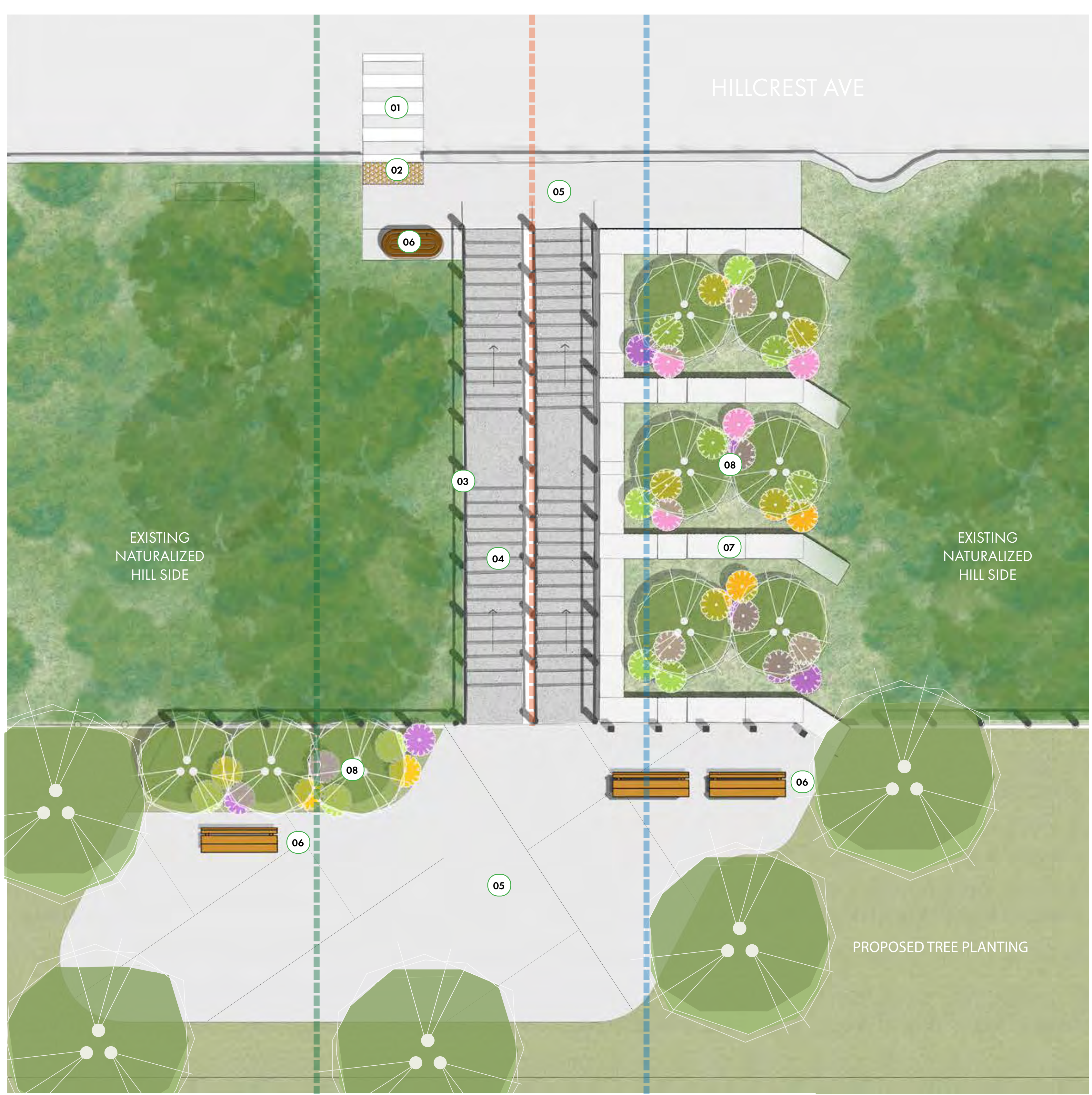
Artist rendering. Actual design may differ