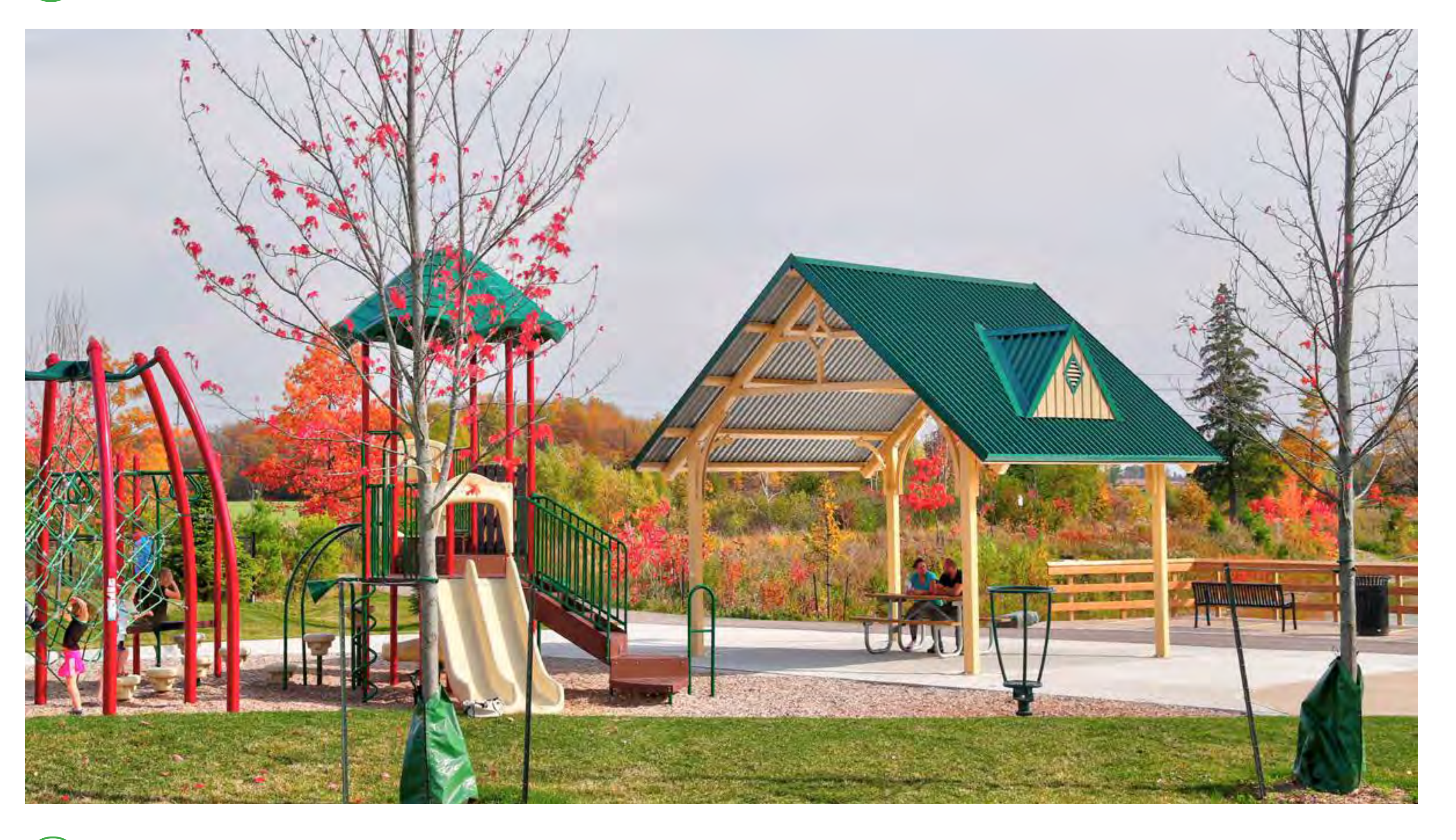
04) TRADITIONAL SQUARE PERGOLA